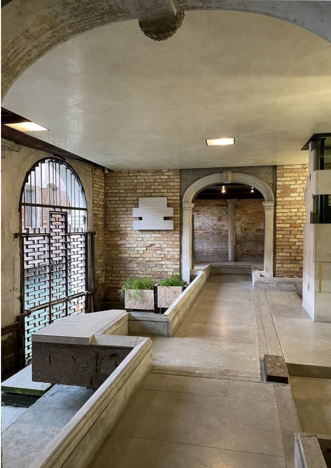
Figure 6: Carlo Scarpa's Quirini Stampalia in Venice – rich interpretations of Venetian building culture.

marble dust, and together with craftsmen Scarpa experiments with colors and luminosity, utilizing the artisanal techniques.