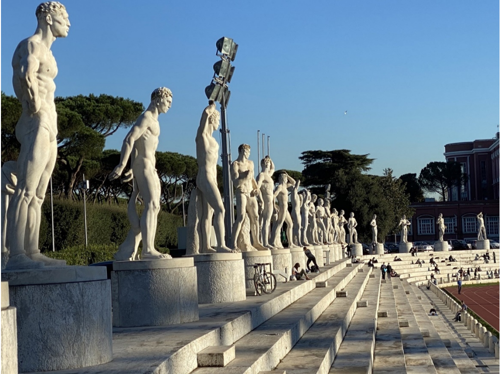
Figure 4: Stadio dei Marmi at Foro Italico, Rome. Each sculpture represents an Italian province.

The traditional media and typologies where marble was used in the fascist era included mosaics, inscriptions, bas-reliefs, sculptural decoration, and monolithic monuments. The large extension of inscriptions carved into marble plates linked the fascist regime directly to its authoritative ancestors.