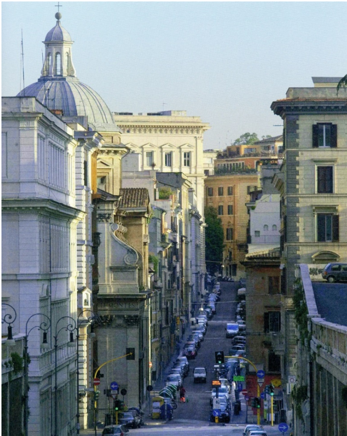
Figure 1: Rome – a city of marble (photo: Anne Pryds Schaldemose in Thomas Harder and Hans Scheving, Glimt af Rom (Copenhagen: Gyldendal, 2009), 293).

Try to imagine Rome without marble. Almost impossible; we all notice the extent of marble in churches and monuments, palaces and houses, squares and streets (fig. 1). There is a simple reason: from Augustus’ era and on, the territorial conquests by the Romans brought enormous amounts of wealth and luxury to the centre of the Roman Empire. Marble ornaments from each of the provinces that the Romans had conquered were imported and exposed to show their power over that particular territory.