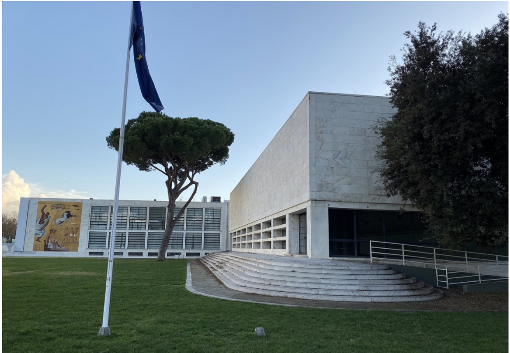
Figure 5: Luigi Moretti's Accademia della Scherma. A white refined marble building.