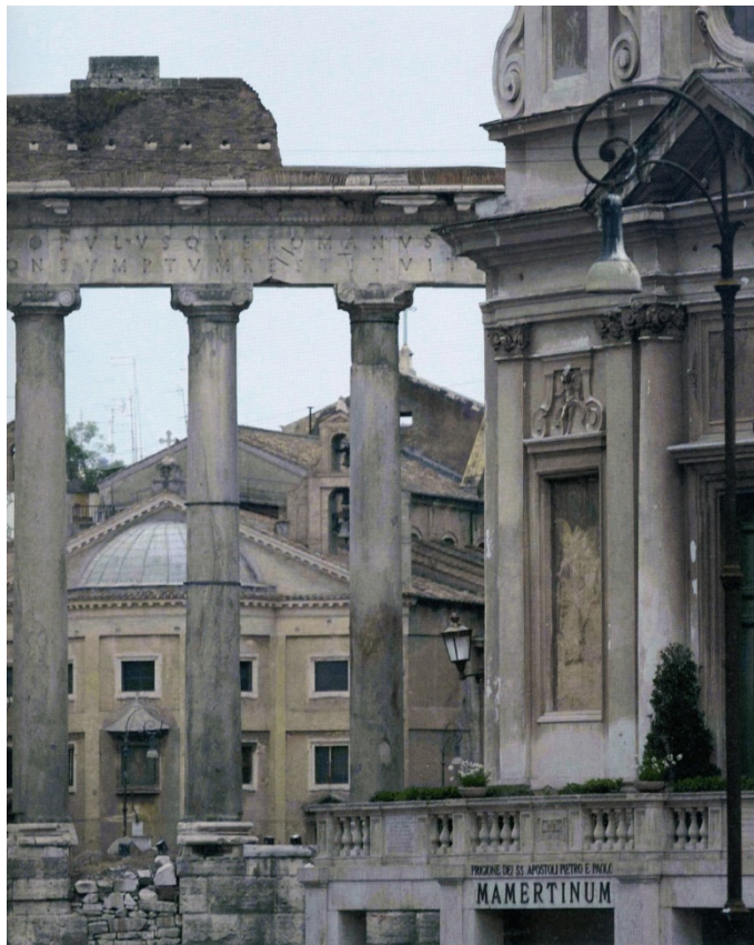
Figure 3: Antiquity and Middle Ages meet and blend, view from Rome (photo: Anne Pryds Schaldemose in Harder and Scheving, Glimt af... , 21).

Headlands are laid open to the sea, and nature is flattened. We remove the barriers created to serve as the boundaries of nations, and ships are built specially for marble. [...] when we hear of the prices paid for these vessels, when we see the masses of marble that are being conveyed or hauled, we should each of us reflect, and at the same time think how much more happily many people live without them. That men should do such things, or rather endure them, for no purpose or pleasure except to lie amid spotted marbles, just as if these delights were not taken from us by the darkness of night, which is half our life's span!" 5 .