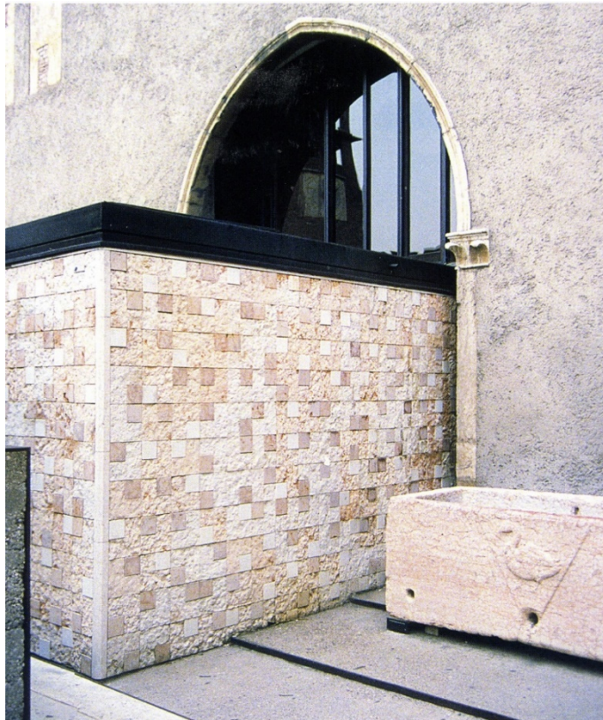
Figure 7: Il Sacello, a refined marble cube clad with the local Verona marble, Pietra di Prun (photo: Anne-Catrin Schultz, source: Schulz, Carlo Scarpa... , 94).

In Castelvechio, Verona (1957-1964) Carlo Scarpa interprets the history and architecture of the castle by revealing, subtracting and adding spatial and material layers to the existing building complex 10 . His architecture reveals a Venetian character talking about the impact of water, water levels, renewal and decay, erosion, and time. Working on-site he develops suggestive details in close collaboration with local craftsmen, strongly embedded in Venetian building traditions. Not only Venice is recognizable, but also the specific character of Verona with its medieval structure and walls, local forms, and local stones and marble 11 . The particular marble, Pietra di Prun which is excavated in the nearby mountains visible from the city of Verona, is used and elaborated according to local craftsmanship.