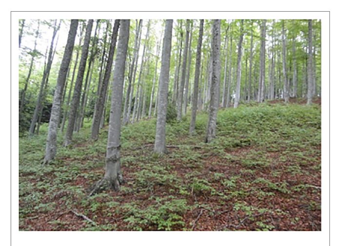
FIGURE 4 | Image for the category of MOUNTAINOUS BEECH FOREST.

can be used to obtain a dataset of images tagged with one or more countries, which is very useful to carry out advanced queries in the TKB.