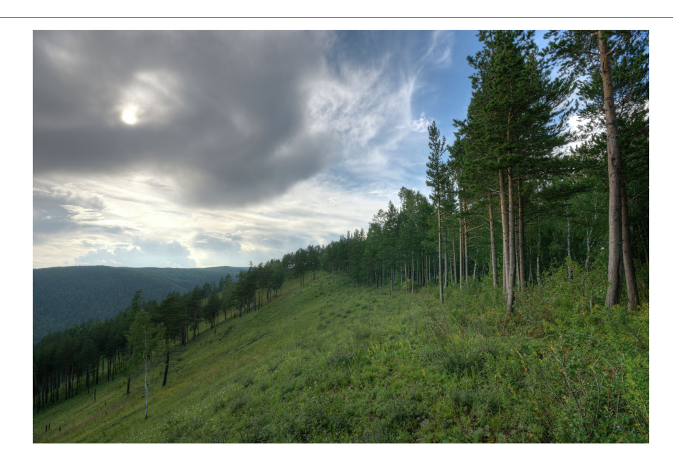
FIGURE 3 | Reproduced with permission. Image licensed under the Creative Commons Public Domain CC0 1.0 Universal, available at https://es.m.wikipedia.org/ wiki/Archivo:Krasnoyarsk_Taiga.jpg.