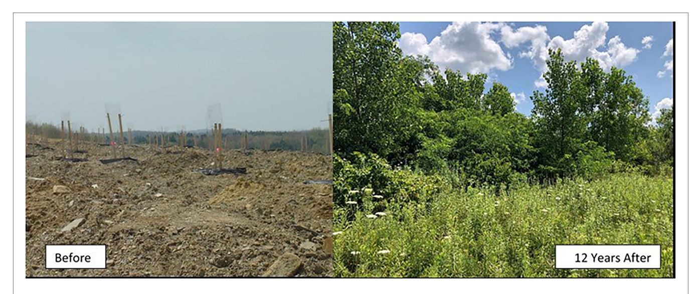
FIGURE 1 | Image for REFORESTATION has_result FOREST. Source: The American Chestnut Foundation. Reproduced with permission from The American Chestnut Foundation (TACF), available at https://acf.org/science-strategies/restoration/.