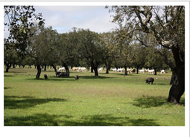
FIGURE 6 | Image for the category of BROADLEAVED EVERGREEN FOREST (Portugal).