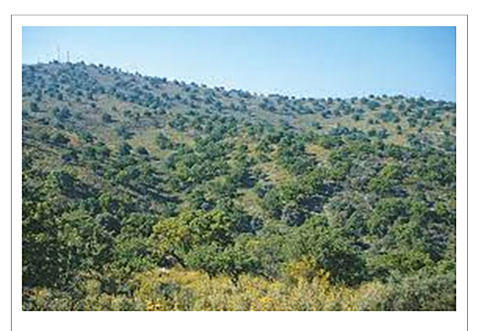
FIGURE 5 | Image for the category of THERMOPHILOUS DECIDUOUS FOREST. Source: European Red List of Habitats—Forests Habitat Group. Reproduced with permission from Stamatis Zogaris, available at https://acortar.link/ dM3PWV.

Nevertheless, even though referential similarity is a fundamental requirement in image selection, it would be redundant to find several images that are quite similar. For example, Figure 4 shows, a beech forest and a mountainous beech forest. Unfortunately, this dimension is not particularly evident in the image since it is difficult to find an image that clearly illustrates both the type of trees and its mountainous location. However, thanks to this, Figure 4 can also be used to represent a beech forest, thus avoiding image overload.