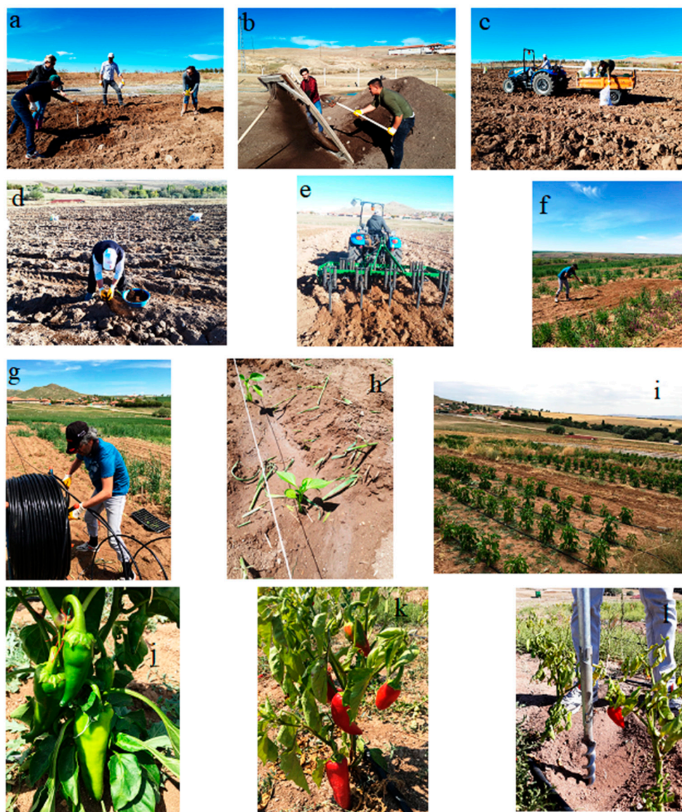
Figure 2. Pictures showing the field procedures carried out in the trial ((a): parceling, (b): sieving of manure, (c): moving the sieved manure to the garden, (d): the application of manure to the soil, (e): mixing manure into the soil with a cultivator, (f): raking of soil before planting for leveling, (g): installation of drip irrigation, (h): seedlings given life water, (i): grown pepper garden, (j): views from when peppers are green, (k): views from when peppers are red, (l): soil sampling procedure from 0–20 cm depth by auger).

for analysis from four different points of each plot, representing the plots in the best way possible. After sampling, five replications of penetration measurements were made at the intact points of the plots. Care was taken to make sampling and measurements over the rows. The trial was constructed over two growing seasons (2018–2019 and 2019–2020), and the operations in the second season were exactly the same as in the first season (Figure 2).