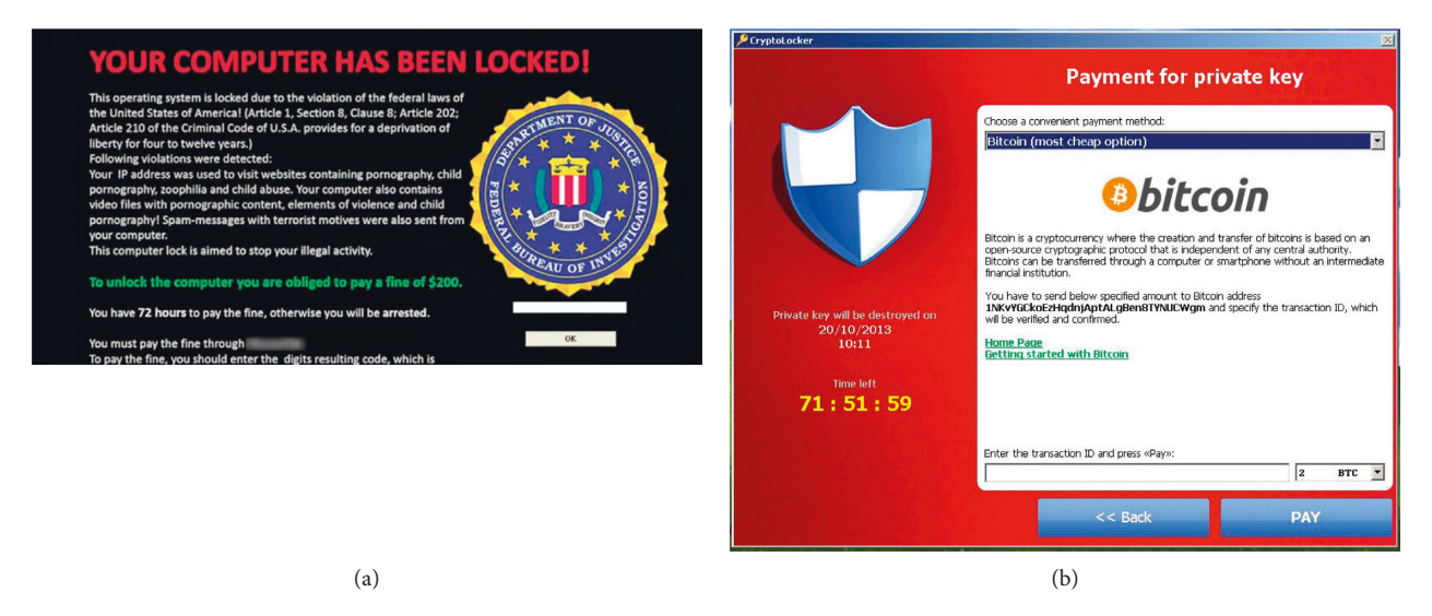
FIGURE 1: Example of ransomware screens/messages: (a) locker, (b) crypto-ransomware.

and sanctioned by its simple execution because by itself it affects to the integrity of the devices or data. Requiring a certain level of seriousness of attack would be equivalent to guaranteeing impunity for actions that have not satisfied that condition because of failures in their execution and not because of unwillingness to commit the criminal act. A second question is to ascertain the criteria to be followed in order to assess the seriousness of the attack. It could be qualitative, quantitative or both. The sole certainty is that it has not been determined and this fact leads to legal uncertainty and insecurity.