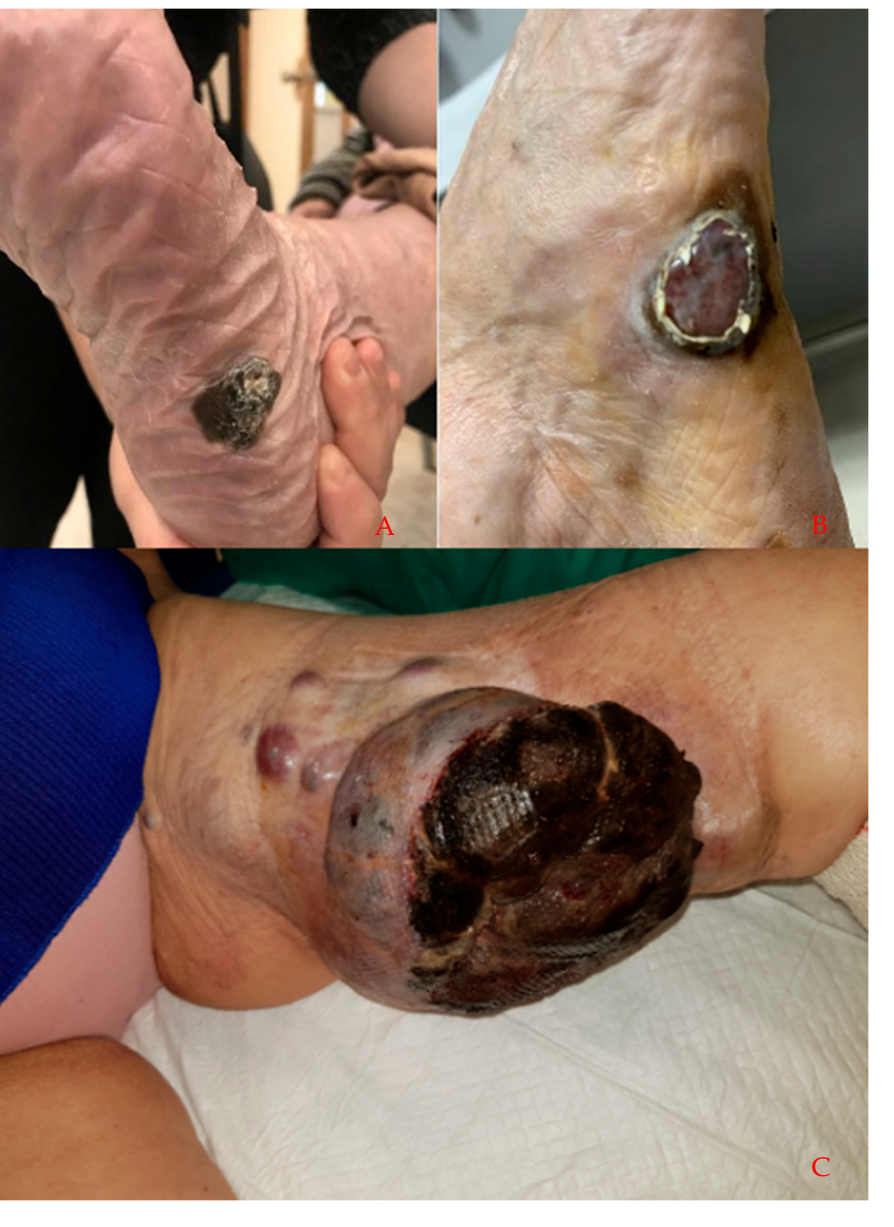
Figure 1. Clinical images of malignant melanoma diagnosed after the onset of the COVID-19 pandemic. ( A ) 81-year-old female patient with a 3.2, nonulcerated melanoma. ( B ) 65-year-old male patient with a 4.1, ulcerated melanoma. ( C ) 54-year-old female patient with a locally advanced melanoma.