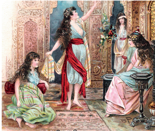
Figure 5. Postcard, Castans Panopticum, 1901.

Designing emotions into his museum objects to increase their suitability for public health education implied an eager willingness to engage in careful discrimination. Zeiller remained especially cautious not to combine curiosity with what his contemporaries called «visual pleasures». The tension between education and entertainment became particularly visible when wax