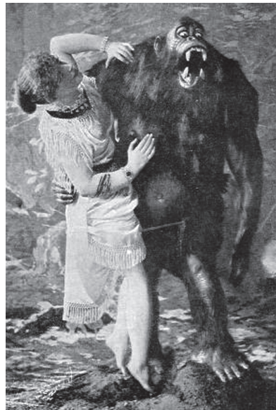
Figure 2. Advert of R. Schulze's panopticon, ca. 1900.