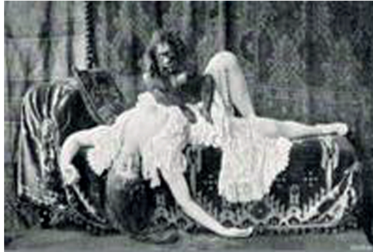
Figure 4. «The nightmare», life size wax model, Munich Panopticon, ca 1900.