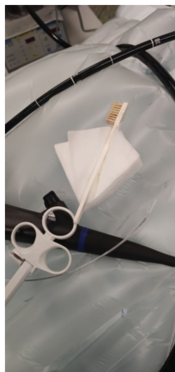
Figure 2. Image of the used endoscope and the toothbrush once removed.

The fb described above was observed in the stomach with no lesions on the oesophageal or gastric mucosa. The fb was successfully removed via endoscopy using a polypectomy snare videogastroscope Olympus GIF-1100 (Olympus Iberia, Barcelona, Spain) (Figure 2). After three hours of monitoring, the patient was discharged.