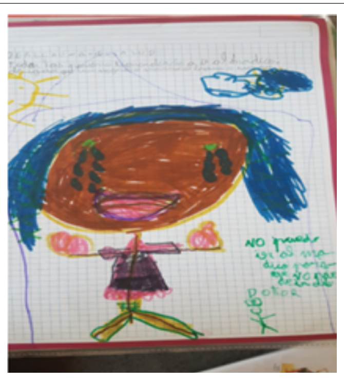
Figure 3: Drawing by a primary school student and an infant school student explaining what the right to health means for them (Photograph: Author, 2021)

In the case of other rights, such as the right to play, the right to housing, the right to education, the right to have a family, the right to equality and the right to asylum, the children were quite clear, and they tried to draw representative elements such as schools, playgrounds and a house. These drawings, alongside the children's thoughts, were collected in an illustrative document called 'The Book of Rights'. It was also possible to observe that the students continuously responded to injustice. This is how the teacher describes it in the class journal: