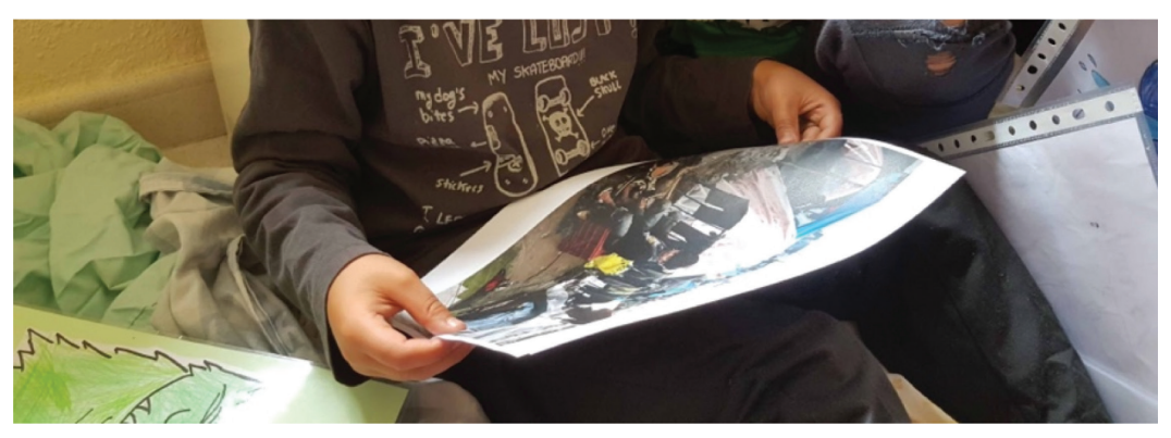
Figure 5: A student observes one of the images showing a refugee camp

Any pedagogy that aligns with the construction of citizenship according to a model of social justice (Westheimer and Kahne, 2004) must not forget the earliest educational stages. Even at the earliest ages, we must use teaching strategies that incorporate the diversity of children's languages to ensure that they can express themselves freely, creatively and authentically (Edwards et al., 2011). As a