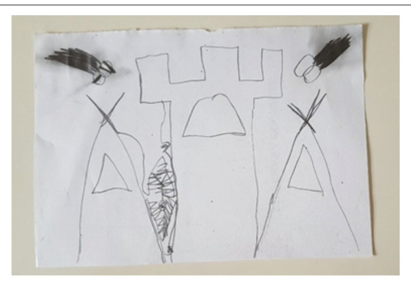
Figure 2: Drawing of a refugee camp made a pupil

In the drawings of the refugee camp, the provisional nature of the housing and its precariousness are emphasised, in contrast to other housing constructions that the children have drawn at other times, which are represented not only as being made of sturdy materials such as brick, but also include complete rooms and furniture.