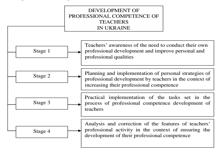
Source: Compiled by the authors by Byrka, M. F., Sushchenko, A. V., Lukashiv, T.O., 2019 Figure 2: Stages of development of professional competence of teachers in Ukraine

It should be noted that the algorithm for the development of professional competence of teachers under the conditions of transformation processes in education in Ukraine includes several stages, the detailed characteristics of which are presented in Figure 2.