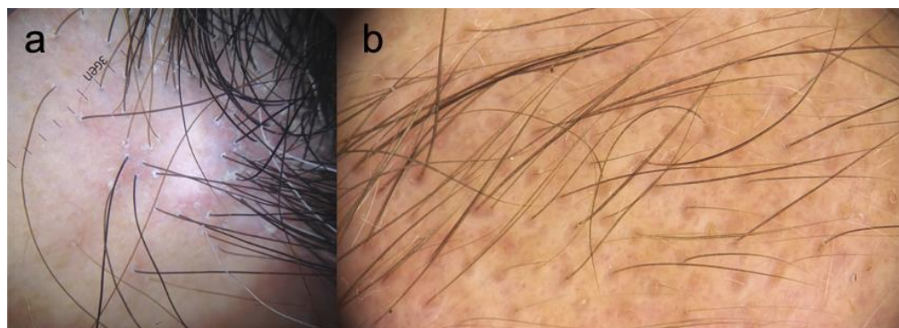
Figure 4. (a) Frontal hairline: perifollicular erythema and hyperkeratosis, follicles with one hair shaft, white patches, and loss of follicular openings. (b) Eyebrows: partial alopecia with red follicular dots.

Perifollicular erythema and follicular hyperkeratosis, along with the loss of follicular openings in the affected hairline, are the main trichoscopic findings in FFA (Figure 4a) [22]. The presence of follicular ostia with only one hair shaft is another frequent feature. The background in FFA is ivory-white [146]. Perifollicular hyperpigmentation, as well as pinpoint white dots in the alopecic band, are characteristics of darker-skinned patients with FFA [15,16,147]. Black dots, broken hairs, pili torti, and branching capillaries may also be seen, as well white patches in advanced disease [148].