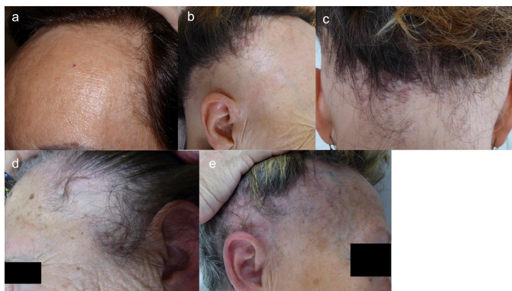
Figure 3. (a) Recession of both fronto-temporal hairlines, mimicking male AGA (AGA-like pattern). (b,c) Recession of the whole hairline, from frontal to occipital (ophiasis-like pattern). (d) Oval alopecic patches in the temporal region, sparing a thin band of temporal hairline (cockade-like pattern). (e) Recession of temporal hairline extending upwards to the parietal scalp (upsilon pattern). In this patient, the frontal hairline is also affected, but not the occipital area, and neither is the retroauricular region.