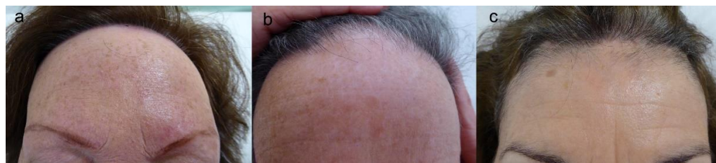
Figure 2. (a) Pattern I: linear and uniform hairline recession, without loss of hair density behind the new hairline. (b) Pattern II: diffuse alopecia behind the frontal hairline with loss of hair density behind. (c) Pattern III: unaffected primitive frontal hairline followed by an alopecic band, forming the pseudo “fringe sign”. Note the absence of eyebrow alopecia.

The hairline recession is usually bilateral and symmetric [12], but asymmetric forms have also been described. Advanced cases can lead to a “clown alopecic pattern”, with total hair loss in the frontoparietal area [12]. Three clinical patterns of FFA, established according to frontal hairline recession, have been described (Table 2, Figure 2) [116]. Unusual patterns have also been reported (Table 2, Figure 3) [117,118].