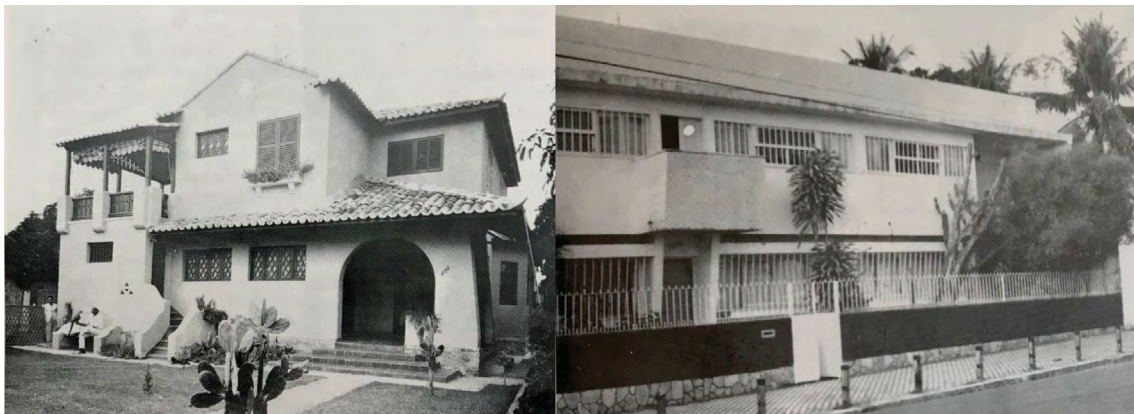
Figure 4.1: Residence designed by Manuel Messias de Gusmão in the 1930's in Farol (neighborhood)

However, «estar em consonância com as novas tendências nacionais e internacionais bate às portas da cidade». 10 For example, that is when the building code is revised and natural lighting and ventilation become requirements for all rooms, which left all the semi-detached houses prior to the bungalows out of the city-required standards.