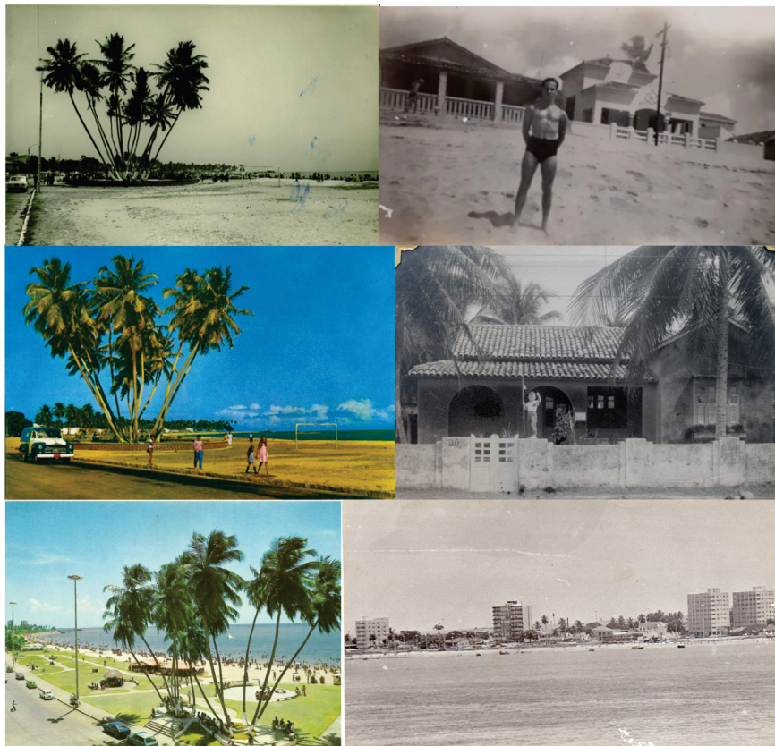
Figure 5.1: Pajuçara in the 1950's

This movement is contemporary to the verticalization in Maceió, since in the 50's there is the beginning of high-rise buildings implementation followed by the residential buildings, which is the topic of the next section.