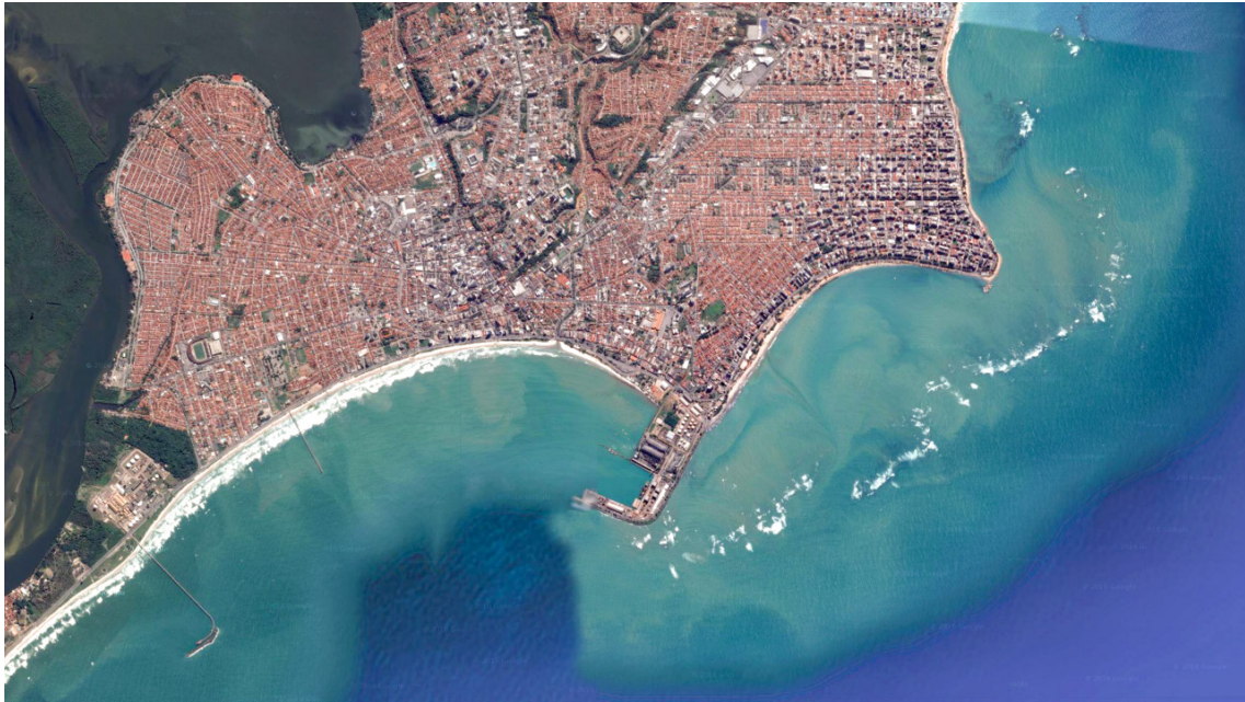
Figure 2: Satellite image of Maceió

During the 30's the sea is “discovered” as a place of enjoyment. The habit of sea bathing becomes regular. Consequently, on the following decades, the search for vacation houses by the sea in the neighborhood called Pajuçara increases. The fishermen houses placed amid a vast area covered by coconut trees were gradually replaced for those houses, driving the original occupants away from the shore.