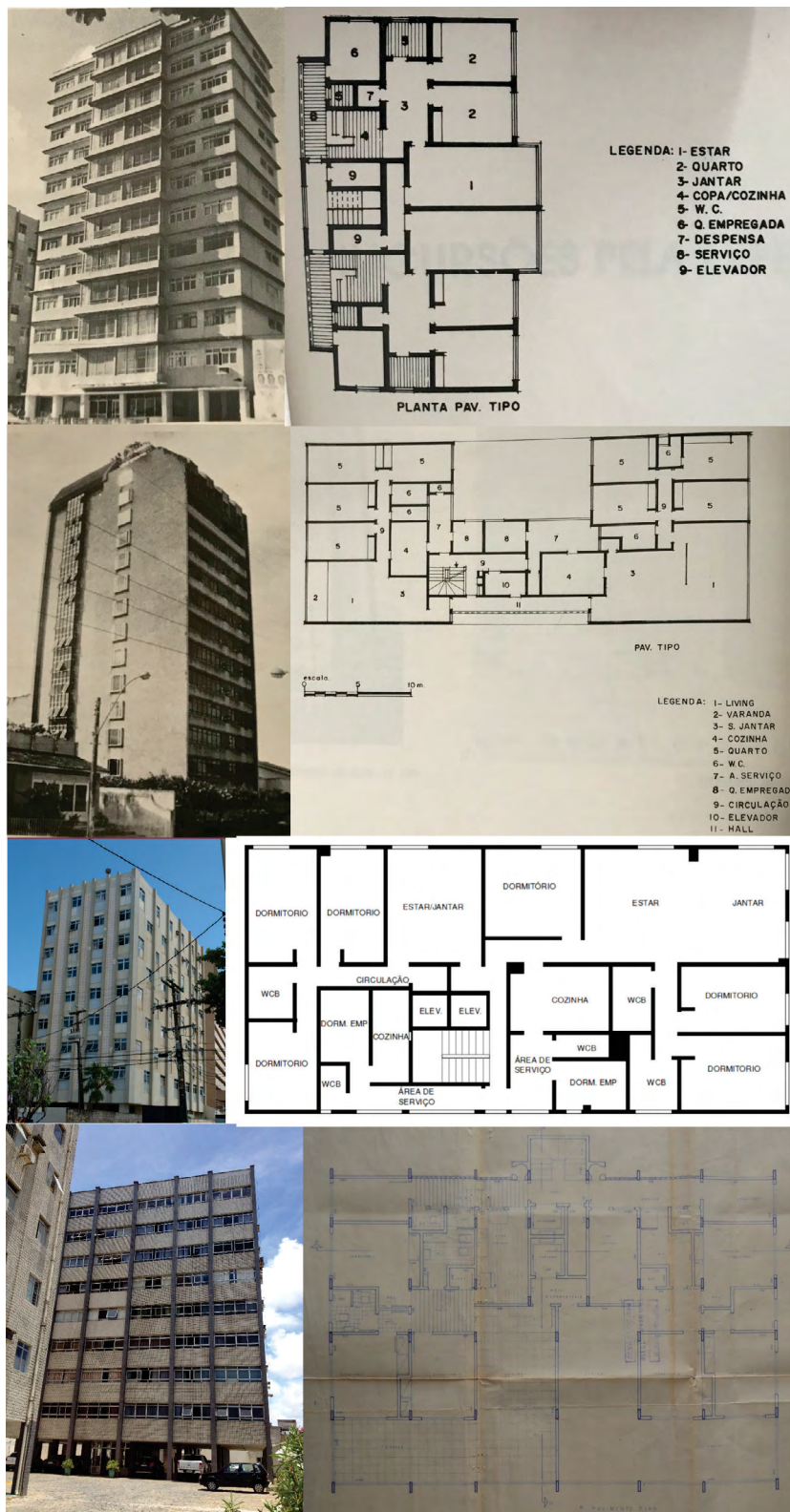
Figure 6: The first residential high-rise buildings in Maceió and their floor plans