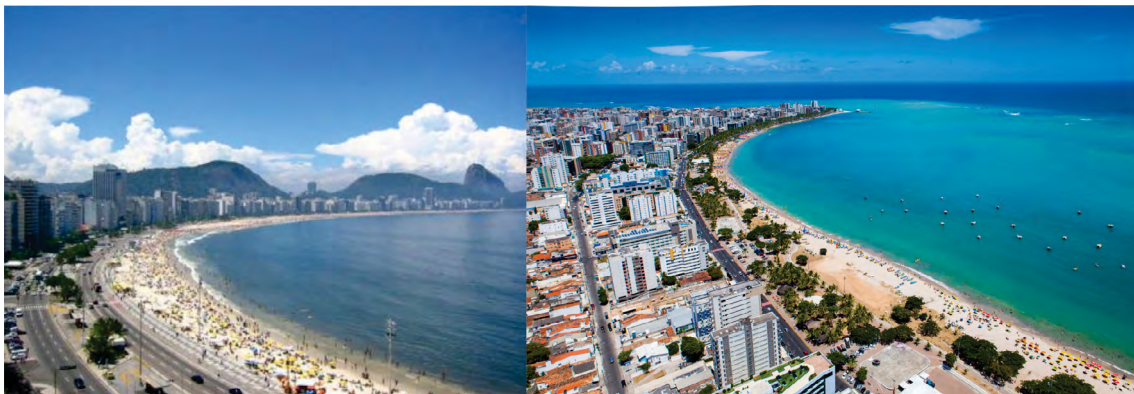
Figure 1.1: View of Copacabana, Rio de Janeiro

Regarding the state capital of Alagoas, we move to the opposite side of the country. We follow its steps into becoming a touristic reference focusing on the neighborhoods Pajuçara, Ponta Verde and Jatiúca. Their urban construction, as well as in Copacabana, is developed associating touristic appealing attributes to vertical skyline development.