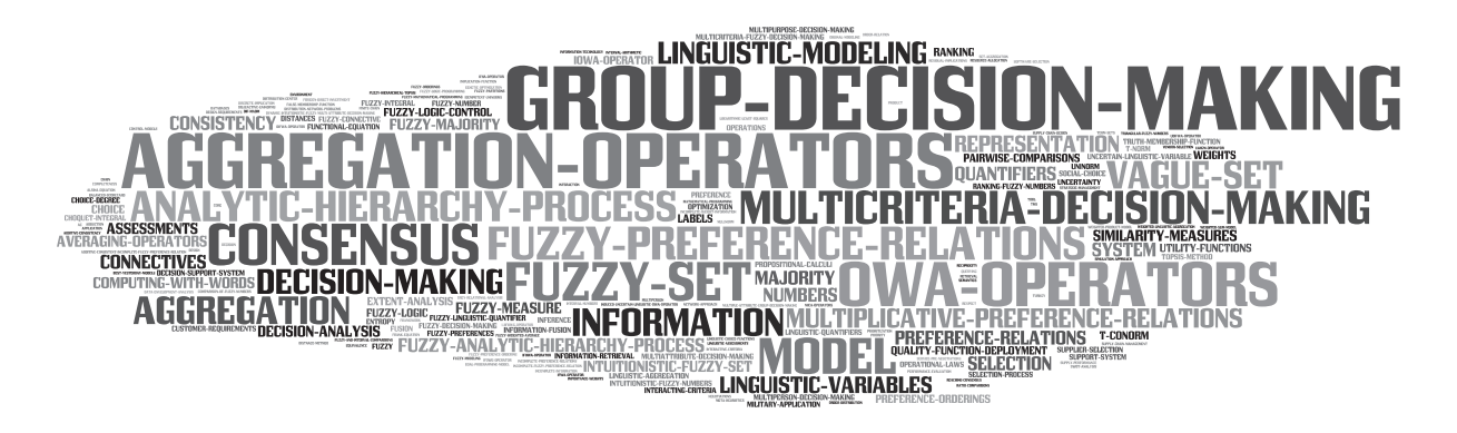
Fig. 2. Cloud tags