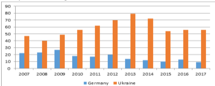
Figure 1: Quality rating of the education system in Germany and Ukraine, rank

According to the quality rating of the World Bank's (2017) education system during 2007-2017, Germany is one of the best countries with a high level of quality in the education system. In 2017, the position of Germany in the ranking improved significantly compared to recent years, because this country entered the top ten countries in terms of the quality of the education system. With regard to the quality of the education system in Ukraine, the places of our country in this rating were in extremely unstable dynamics. Therefore, Ukraine ranked the 79th place among 151 countries and was below the world average in 2013. Instead, in 2015–2017 Ukraine's position improved slightly and normalized, as Ukraine ranked the 54th and the 56th places respectively in the ranking (Figure 1). According to the results of surveys and researches conducted by the World Population Review (2020), it is worth noting that Germany is among the ten most educated countries in the world. Thus, according to the rating of education, Germany took the 4th place in 2018.