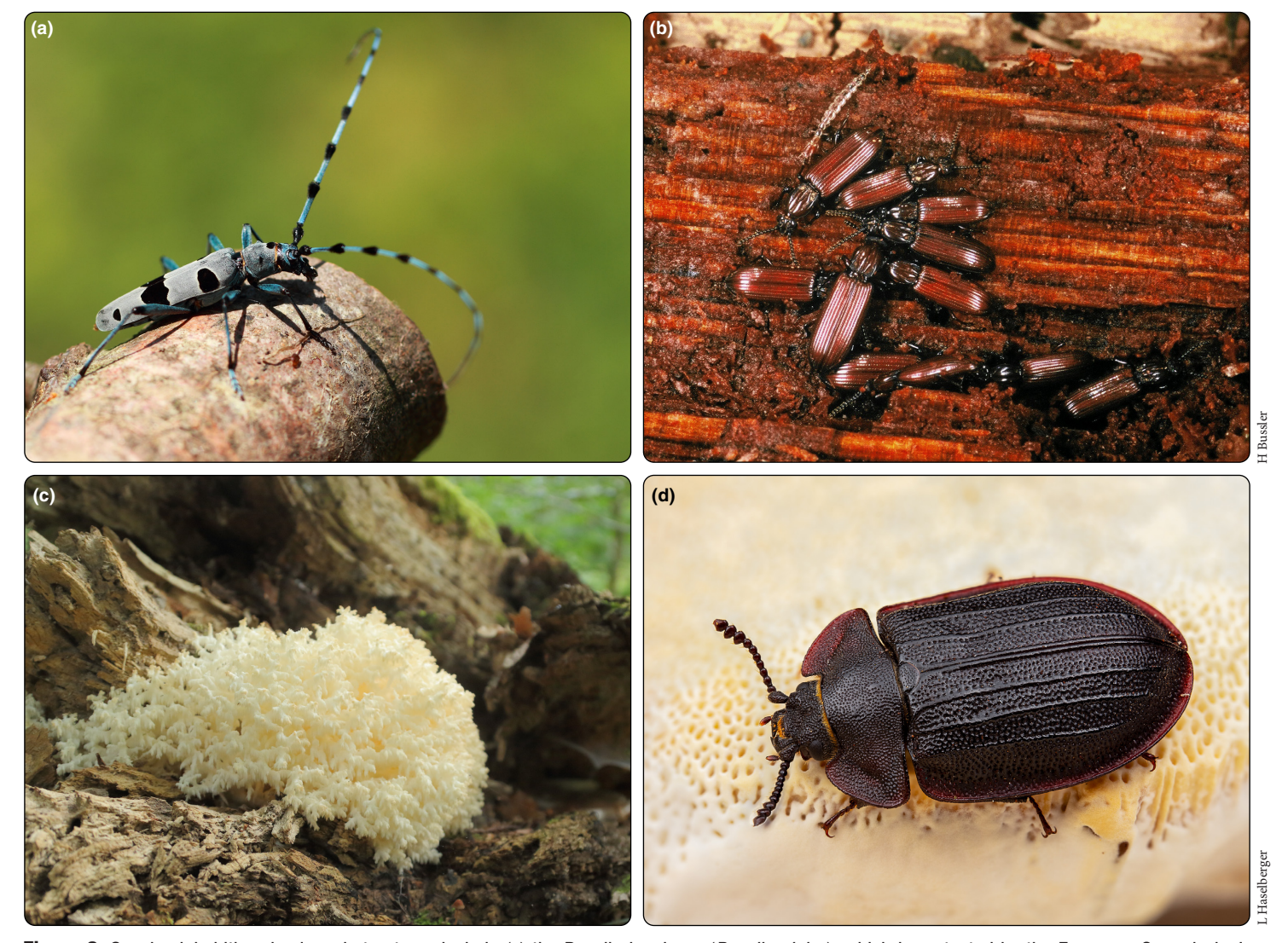
Figure 2. Species inhabiting deadwood structures include (a) the Rosalia longicorn (Rosalia alpina), which is protected by the European Commission's Habitats Directive and breeds in large, sun-exposed, dead deciduous trees; (b) the rare wrinkled bark beetle (Rhysodes sulcatus) inhabiting advanced brown-rot decay stages of large-diameter trees; (c) the rare wood-inhabiting fungus (Hericium coralloides), which is now restricted to old-growth forest reserves; and (d) the bark-gnawing beetle (Peltis grossa), which is strongly dependent on wood subject to fungal decay.

The importance of deadwood as habitat for insects was recognized early on, including by naturalists searching for previously undescribed species in the late 19th century (Wallace 1869) and ecologists in the early 20th century (Graham 1925). By the end of the 20th century, the historical ranges of several species had been greatly reduced due to overexploitation of deadwood (Figure 2). For instance, the wrinkled bark beetle (Rhysodes sulcatus) has been extirpated from large parts of Europe for more than