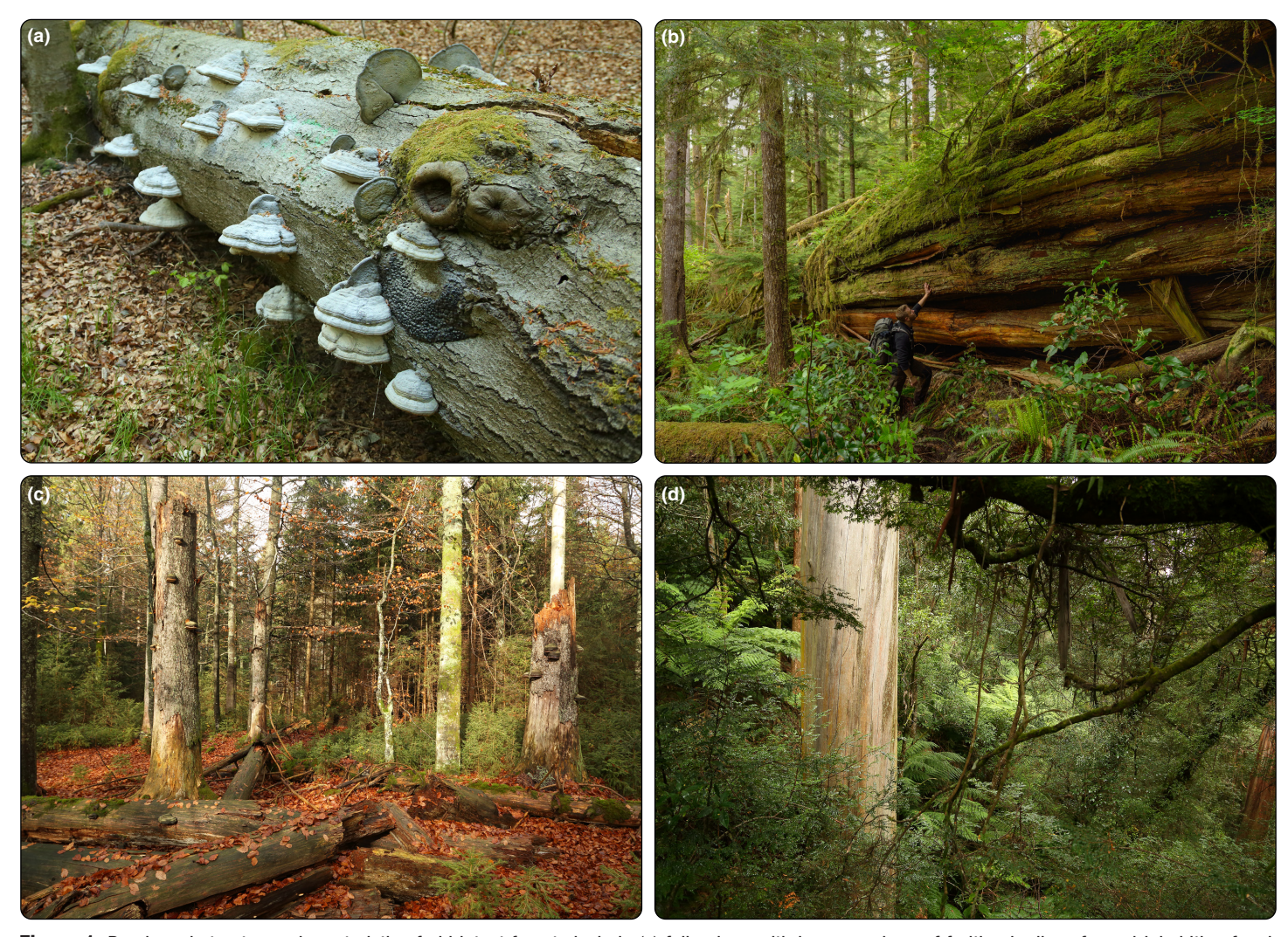
Figure 1. Deadwood structures characteristic of old intact forests include (a) fallen logs with large numbers of fruiting bodies of wood-inhabiting fungi; (b) large logs in an advanced state of decay, which facilitate the regrowth of natural vegetation, such as in old-growth forests in the US Pacific Northwest; and (c) standing dead old trees created by natural disturbances like bark-beetle outbreaks. Such dead trees can persist for decades and are often sun-exposed ecological islands in otherwise closed canopies, such as in (d) old-growth mountain ash ( Eucalyptus regnans ) forests in Victoria, Australia.

At present, deadwood removal includes, for instance, fuel wood and stump biomass extraction (Jonsell 2007), selective logging of high-value large old trees (Ahrends et al.