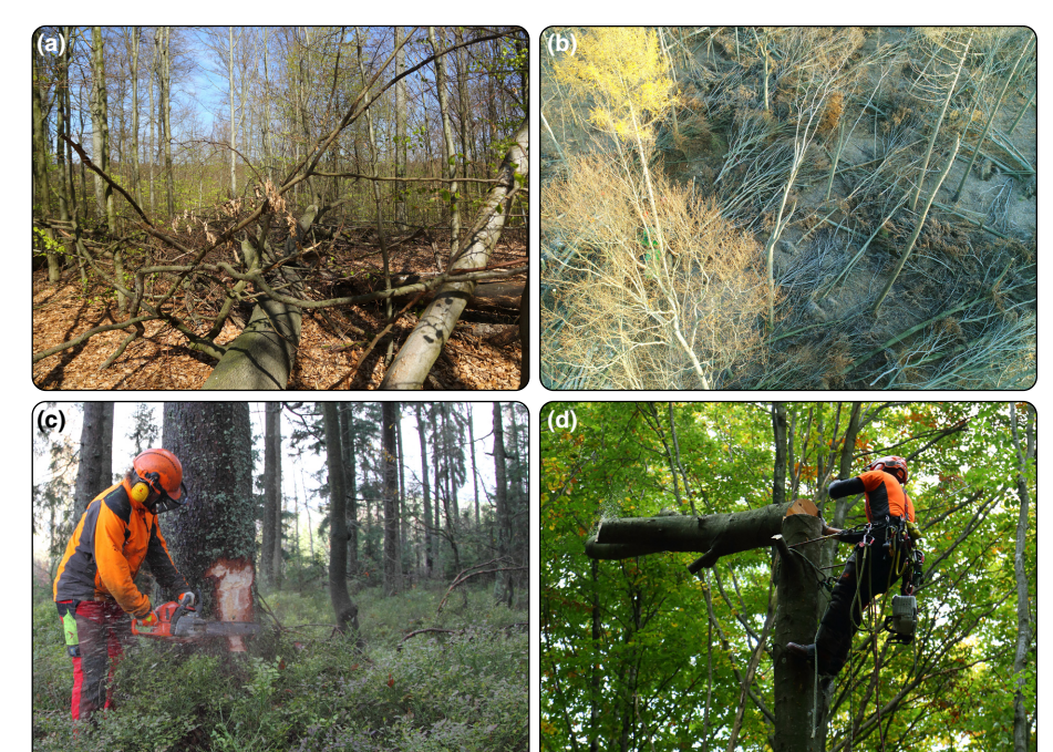
Figure 3. Deadwood creation in managed forests may encompass passive methods, such as (a) the retention of tree crowns with low economic value in selective-logging systems and (b) the partial or complete set-aside of areas affected by natural disturbances for natural succession; and active methods, such as (c) girdling a vital tree to initiate tree death and (d) topping of trees to create sun-exposed high stumps.

selected both as a flagship species for deciduous forest conservation and as a tool for communicating deadwood conservation (Roberge et al. 2008).