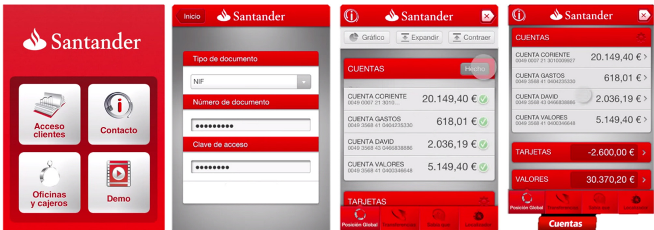
Figure 2 Video images shown to subjects.