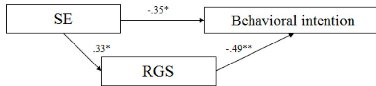
Fig 2. Path model for the prediction of behavioral intention in the implicit context for women. * p < .05 , ** p < .01 .

https://doi.org/10.1371/journal.pone.0232889.g002