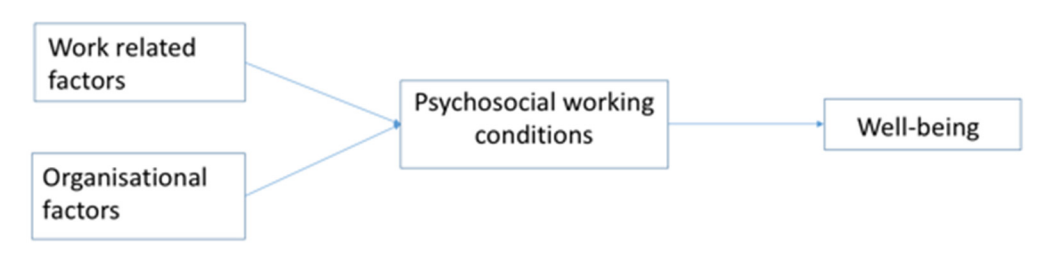
Figure 1. Study conceptual framework.

This paper aims to expand the existing literature by comparatively examining the relationship between employment (organizational and work-related) factors, psychosocial working conditions and well-being in migrant and native workers in Spain. The study uses the conceptual framework presented in Figure 1.