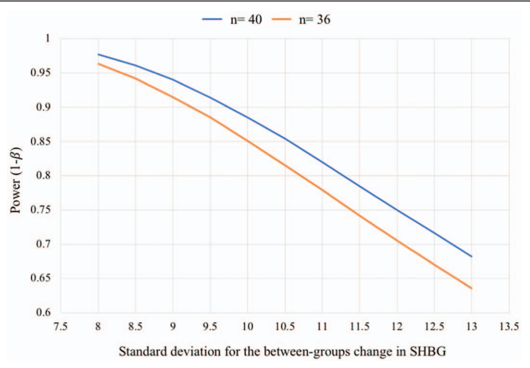
Figure 1. Study power curve to detect a 10 nmol/L increase in the primary outcome (SHBG) for different standard deviations of the between-group difference in the change from baseline.

standard deviation equal to the expected effect), with a statistical power of 85% and an \alpha error of 0.05, 36 women (n=18 per group) will be needed. Anticipating a 10% follow-up loss, we will aim at recruiting ~40 women. Adherence strategies will be implemented during the intervention program to minimize potential follow-up losses. If no participants are lost to follow-up, the final power of the study (with n=40) for detecting the indicated effect would be 88.5%. In the absence of an accurate estimate for the expected standard deviation, Figure 1 represents the power curve for estimating the expected effect (the variation in the SHBG change between the EG and the CG of 10 nmol/L), considering different standard deviations and for a sample size of 36 (n ~ 18 per group) or 40 (n ~ 20 per group).