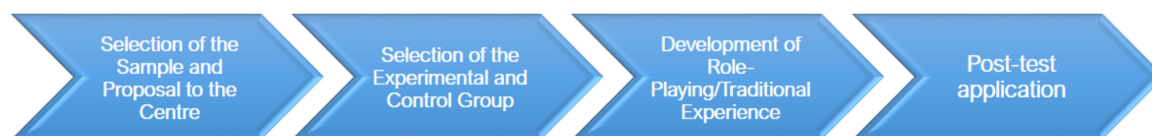
Figure 1. Research stages.

The next step consisted in the elaboration of two pedagogical proposals, through which the proposed didactic unit could be carried out. One of these proposals was the expository method, that is, a traditional teaching method where the teacher acts as an information facilitator, and the students do not actively participate in this presentation of contents, but rather carry out a series of activities after the exposition of the subject, in most cases in the notebook or word processor. The other pedagogical proposal was the role playing linked to the video as an educational element. In view of these facts, two groups were formed; on the one hand, the control group that experienced the traditional methodology, and, on the other hand, the experimental group that carried out the method through cooperative work groups.