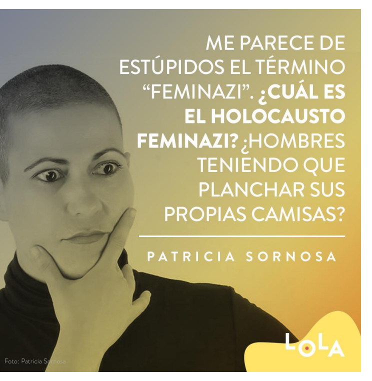
Figure 7 – LOLA, August 13th 2018

The example in Figure 6 represents distinctly the type of humorous content that the page shared. It can be said that it targets people who identify as women and the aim is to report a common everyday experience which is shared by the majority, hence the great success of the post in terms of users' feedback: it reached eleven thousand reactions, thirty-seven thousand shares and one thousand five hundred comments. The style of the image is very common to find online and it engages with the followers through humour. It is interesting to notice that the most reacted picture of the page is not focused on a feminist topic: rather, it involves the users in a conversation about the only two secure things in life. It contrasts an ordinary yet amusing experience (the fact that sleeping in a vest usually implies waking up with one breast outside), with the inevitable question of death, creating a fun response in the readers. As it was said in the beginning, pop feminism does not want to be too serious. In the words of LOLA 's editor, the creation of the page came from the desire of sharing feminist content with people, as Spain was lacking this type of material at the time. Thus, the decision of creating a page whose objective was to be "feminism for beginners" (Medium, 2019).