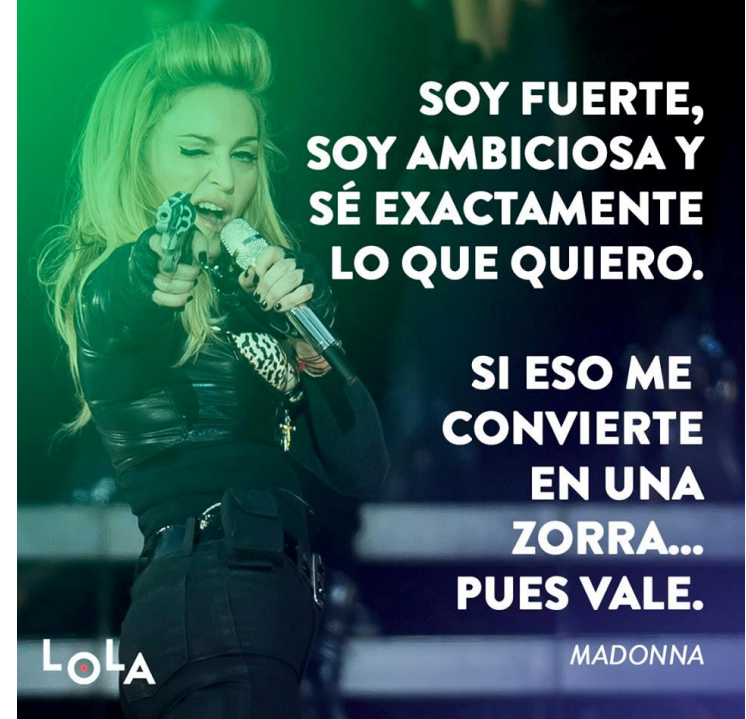
Figure 8 - LOLA, January 16th 2018

«I'm strong, I'm ambitious and I know exactly what I want. If that makes me a bitch...fine» recites figure 8, which proposes the type of feminism for women who can achieve whatever they want through empowerment. It is the same type of pop feminism that Freeda media suggests to its audience.