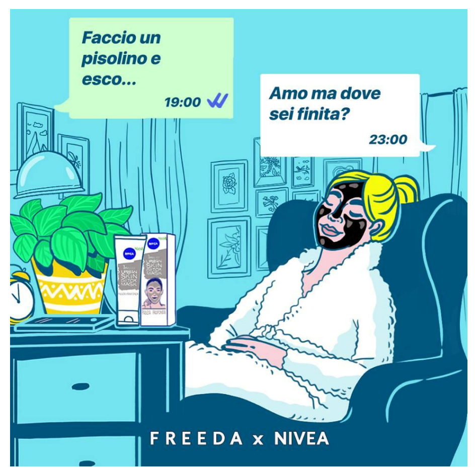
Figure 2 was posted on 24^{\text{th}} May 2019 on Facebook with the caption "Il venerdì sera ideale", "The ideal Friday night", along with the hashtags #NIVEASwitchOffClub and #MaskOnSwitchOff. NIVEA sponsors the content, which shows a girl in a bathrobe relaxing at home with a face mask. Next to her a NIVEA cream tube is shown. On the top of the picture there are two cartoon bubbles that represent a Whatsapp

conversation between two friends. The first one says at 7 PM: "Faccio un pisolino e esco...", "I'll take a nap and I'll come out..."; at 11 PM the answer arrives: "Amo ma dove sei finita?", "Sweetie, where are you?". In this brief exchange, the use of slang words in the text messages is expressing the attempt at representing a generation that is used to talking through the phone, and consequently attempting at relating to them, at a level which can gain their trust. Finally, on the bottom of the image, the writing " Freeda x Nivea" appears.