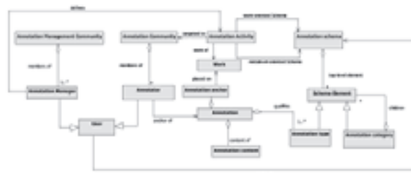
Figure 1: @Note information model