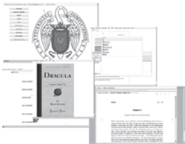
Figure 4: Some snapshots of @Note