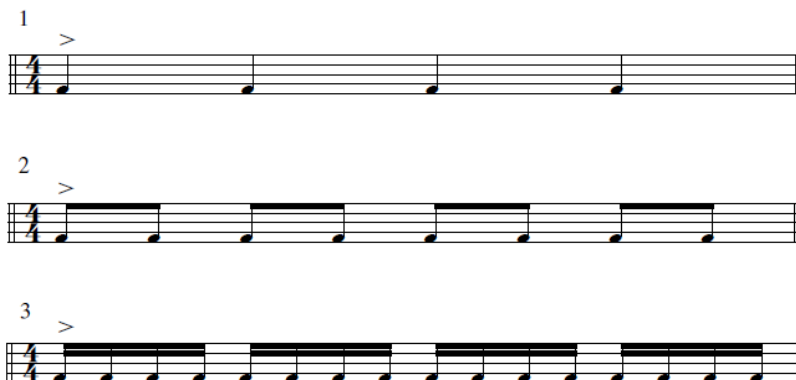
Fig. 2: Multiplicative Rhythms

The group should start with a simple exercise of playing in unison, thus creating a common context. The group leader (e.g., student 1, who can be the teacher) should then set up a regular rhythm - such as that of a relaxed walk - with the pencil on the table top. The rest of the group should join in, making an effort so that the sound of five pencils playing the same regular rhythm should sound as much as possible like one pencil. As shown by the music notation in sequence 1 in Fig. 2, the ostinato sequence being played should be perceived as a regularity of 4 notes by accentuating (playing louder) one note out of every four. In this manner, we are not only perceptually creating a group universe by the synchronicity of events, but also starting to cognitively induce a hierarchy of periodicities (Povel; Essens, 1985). By playing sequence 1 in unison, the students are actively making an effort to succeed in integrating an already complex group context. While listening to the other players and adjusting their playing at the level of the single event, students also have to synchronize at a higher hierarchical level: stressing out one of every four beats.