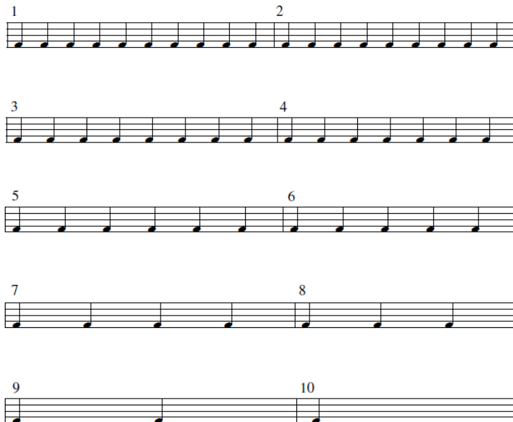
Fig. 3: Additive Rhythms