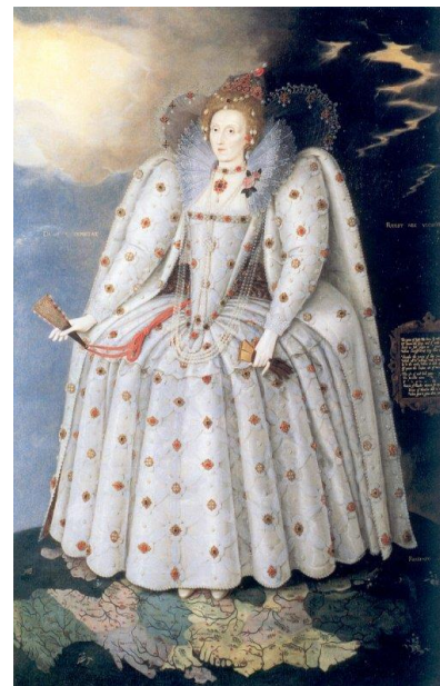
Queen Elizabeth I, the Ditchley Portrait, ca. 1592

By the time Elizabeth's long reign came to an end in 1603, English people had come to esteem their Church. The trials of the last three decades had in a very real sense secured England's Protestant identity. Through a generation of conflict in which the enemy had been foreign, Catholic and dangerous, English people had come to identify their Church and Protestantism, as a cornerstone of their identity.