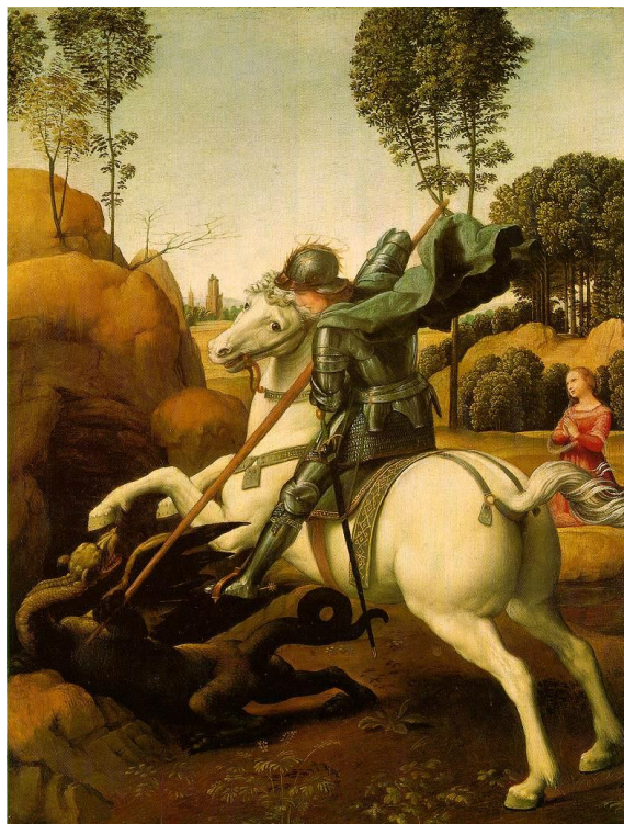
Raphael, St George and the Dragon, 1505-06. National Gallery of Art, Washington

Catholicism, represented by the obscure figure of Philip II. Watch the clip here: http://www.youtube.com/watch?v=-7hd209WDAU&feature=related