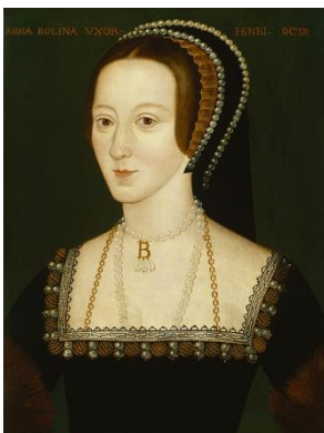
Anne Boleyn, Henry VIII's second wife

The following series of texts opens with one that deals with the kind of choices that a historian must confront when coming up with a narrative of the events he or she is trying to explain, and how these choices necessarily determine the historian's outlook. When studying a culture, we must be aware of the fact that (no matter how complex and sophisticated) it is a story built with episodes, characters, and a certain narrative structure that results from choices on the part of the historian and the status quo or the official position that he is voicing. In this regard, we must also remember that texts have a performative, pragmatic dimension. By selecting some documents instead of others, by emphasising the role of certain historical characters over others, and by presenting a certain sequence of events from the episodes he has decided to include (as he also excludes others), a historian always engages in the construction of a text that has its own performative value—in this case, to support a certain version of national identity, instead of other alternative views.