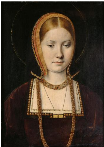
Catherine of Aragon, ca. 1503, by Michael Sittow. She was Henry VIII's first wife.

TASK: Read texts [2] and [3] and answer the following questions: