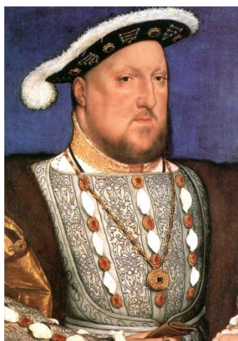
Henry VIII, by Hans Holbein, 1536

The history of the Reformation is still a controversial topic which continues to stir debate in England—even doctrinal controversies between Catholics and Protestants. Given the importance of Protestantism in the construction of English national identity, the role that the Reformation played in the history of the country and its long-lasting impact still lie at the center of public debate. The 16th and 17th centuries—with episodes and characters like the Reformation, Henry VIII, Elizabeth, the Gunpowder Plot, the Civil War, and the Commonwealth—are viewed as founding moments in the history of the country. The way in which these events are interpreted constitutes part of the narrative of English national identity. The importance of this period for English mentality is proved by the proliferation of popular books and