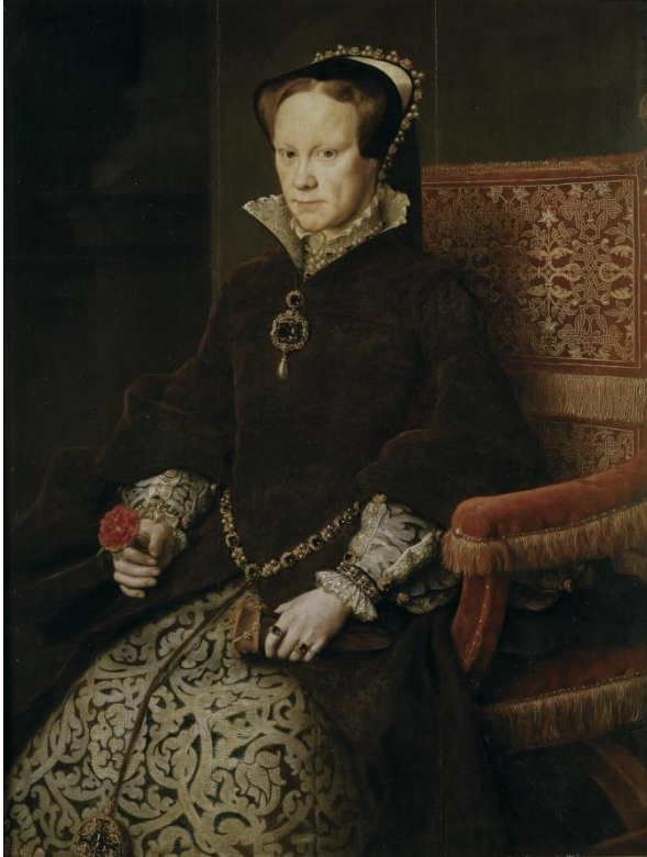
Mary Tudor, by Antonio Moro, 1554. This was the year she married Philip of Spain (later Philip II). She had become queen of England after the early death of her half-brother, the young Edward VI. During her brief reign she brought England back into the Catholic fold. When she died childless in 1558 she was succeeded by Queen Elizabeth I.

Becoming Queen in 1553 Mary, Edward's devoutly Catholic sister, was always going to have a tough time undoing twenty years' work. Although Protestantism remained patchy and its followers a minority, this minority was entrenched and substantial, at least in London and the South East. Mary did her best, reinstating Catholic doctrines and rites, and replacing altars and images, but she handicapped herself by martyring almost 300 ordinary men and women, as well as bigger names like Cranmer.