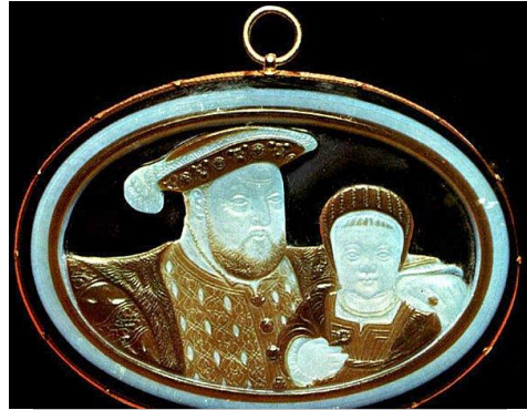
Henry VIII with his young son (by Jane Seymour, wife number 3), who would become King Edward VI after Henry's death in 1547. Edward was only 10 years old when he became king, and would reign for just a few years. Edward VI died in 1553, when he was only 16 years old.

But naturally this is only one side of the story—or rather, one side of the narrative of English national identity. Every historian has an agenda—that is, a point of view, an ideological position, a certain religious doctrine. Inevitably, every historian produces an account of events that is determined by his or her own perspective. This might be a personal opinion held by a particular historian, but it is frequently part of more general trends too. Thus, since Protestants, and Anglicans in particular, have for centuries ruled England, English historians have traditionally written the history of the country, and the role played by the Reformation in it, from a Protestant point of view. But there are also English Catholics who would naturally like to see the role of their faith in the history of the country under a new perspective.