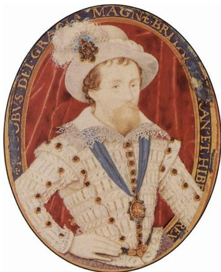
James I, by Nicholas Hilliard, around 1603-1609

Queen Elizabeth never married, and died childless in 1603. The crown then passed on to the moderately Protestant King King James VI of Scotland, who became King James I of England. After the death of Elizabeth, Catholics set high hopes on the new monarch. They thought that his conciliatory approach to theological issues would allow them more freedom to worship openly, and participate in public life. The signing of a peace treaty with Catholic Spain in 1604 increased these hopes. Protestant and Calvinist pressure however managed to thwart attempts to leave more space for Catholics in England. Frustrated, a group of radical Catholics unsuccessfully attempted to assassinate the monarch and the elite of the country. This is the so-called Gunpowder Plot, which is still celebrated in England every fifth of November.