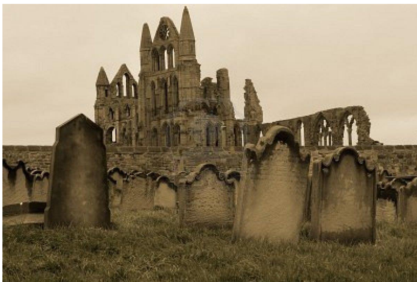
Whitby Abbey, in North Yorkshire. Bram Stoker, the author of Dracula , found inspiration in the ruins of this religious building, whose decay resulted from the dissolution of the monasteries during Henry VIII's reign.

After the Reformation, abbeys, convents, and other religious buildings were either pulled down, or converted and transformed to be used for some other purpose. Many of these buildings were built in the typically late medieval Gothic style. Some of them were simply left to rot and decay, and they remained thus for centuries. In the late 18 th and the 19 th century Romantics found these buildings appealing: their melancholy ruined aspect evoked the passing of worldly glory, and inspired images of death and decay that were dear to the Romantic temperament. As a result, these semi-destroyed buildings became literary and artistic icons, which were used in paintings, poems, and also became part of horror novels (i.e. Gothic literature). Ruined abbeys as an icon of horror, death and ghostly presences have survived until the 21 st century. One of the unintended effects of the destruction and dispossession of the monasteries conducted by Henry VIII's efficient ministers, has thus been the creation of these Gothic icons, which are so common today. Here you have a few of them.