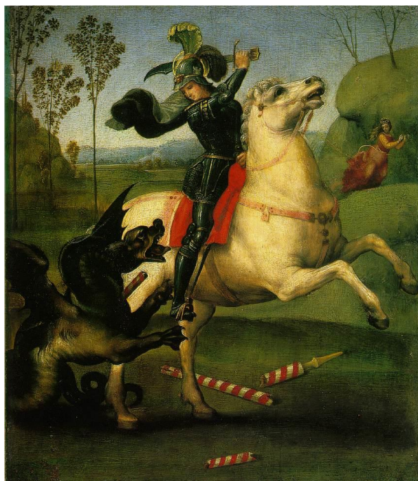
Raphael, St. George and the Dragon, 1503-1505. Musée du Louvre, Paris.

This was not manifested, necessarily, in any very profound grasp of the theological tenets of faith. While English readers seem to have been avid consumers of catechisms and other cheap volumes of religious instruction, their clergy, as elsewhere in Europe, continued to lament how shallow was their grasp of doctrine. Yet the identification could be more subtle and oblique, but still very real. The Catholic festival year, for instance, had been gradually superseded by a calendar of new, largely unofficial and profoundly Protestant patriotic festivals: the defeat of the Armada, Coronation day, the date of Elizabeth's accession. In 1605 they would be joined by 5 November, the date of the discovery of the Gunpowder Plot, proof, if proof were needed that Catholicism was still considered perfidious, deadly and deeply un-English. The celebration of Guy Fawkes' day with bonfires and fireworks is a reminder of how fresh these Reformation controversies remained in the consciousness of the people for many centuries.