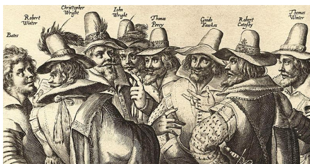
Robert Catesby, Guy Fawkes and some other Gun Powder conspirators

Robert Catesby was a devout Catholic and familiar with the price of faith. His father had been imprisoned for harbouring a priest, and he himself had had to leave university without a degree, to avoid taking the Protestant Oath of Supremacy. Yet he possessed immense personal magnetism, crucial in recruiting and leading his small band of conspirators.