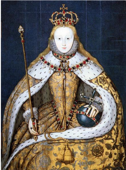
Elizabeth I in her coronation robes. After the death of her half-sister Mary Tudor, she became queen of England at 25.

persecuted remnant; many of its ablest figures taking refuge abroad, to avoid martyrdom - the fate of those whom remained behind.