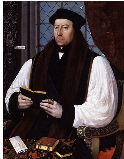
Thomas Cranmer, Archbishop of Canterbury (around 1545). He was the theologian who helped Henry VIII with his divorce and with the implementation of the break from Rome.

So when the history we read is the product of a series of value judgements, some of which we know, some of which we don't, is it surprising that those judgements are questioned by others? Maybe they have their own agenda, maybe they have seen documents you have not. Either way, they disagree with your interpretation. No wonder historians disagree when there is so much to disagree on. The history of historical disagreements is so established that it even has its own word - historiography. This is about the historiography of the Reformation.