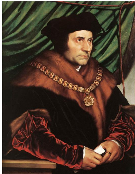
Thomas More, by Hans Holbein, 1527. A humanist, and a close friend of Erasmus, he was also Henry's chancellor. The king executed him in 1535 for his opposition to Henry's break from Rome

So European anticlericalism was nothing new; it had been seething for centuries. What was new this time round was a by-product of the infant capitalism: wealth, urbanisation and education. Whilst still a minority, the literate laity were no longer confined to those in on the game, and were better educated than many priests who claimed to be the path to salvation (while taking their money in taxes). It rankled somewhat.