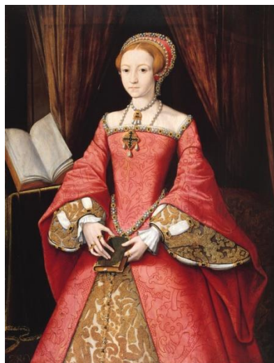
A young Elizabeth at 13. The daughter of Anne Boleyn, she was declared illegitimate after her mother's execution.

So why is the Reformation important? True, it happened a long time ago in a galaxy far, far away, but it established in English minds the image of an island nation, separate and supreme, still resonant today. English policy became increasingly repressive in Ireland, importing Protestant landowners to oppress the locals who resisted conversion. That legacy still lingers, and the abiding sense of anti-Catholicism remained potent enough to be a cause of the Civil War a century later.