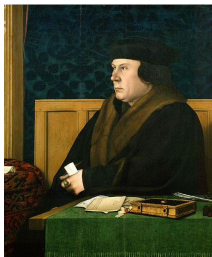
Thomas Cromwell, Henry VIII's chief minister between 1532-1540. He helped Henry obtain his divorce from Catherine of Aragon, and also supervised the Dissolution of the Monasteries. He was executed for treason in 1540.

The Dissolution of the Monasteries lasted four years to 1540. Two thirds of all the land was sold to the laity and the money squandered in vanity wars against France. With the destruction of priceless ecclesiastical treasures it was possibly the greatest act of vandalism in English history but also an act of political genius, creating a vested interest in the Reformation: those now owning monastic lands were unlikely to embrace a return to Catholicism.