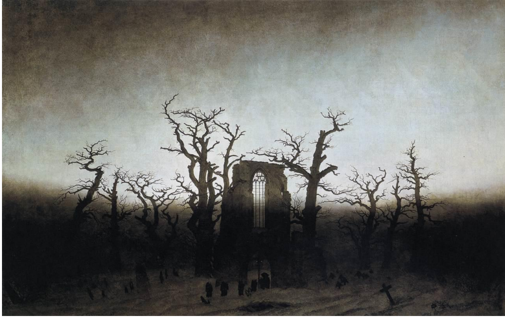
Caspar David Friedrich, The Abbey in the Oakwood (1809-10) Schloss Charlottenburg, Berlin