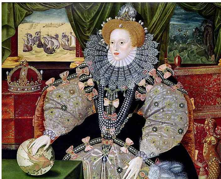
Elizabeth I, the Armada Portrait (after 1588)

But Elizabeth was careful not to erase all traces of Catholic worship and retained, for example, the traditions of candlesticks, crucifixes and clerical robes. By pursuing a policy of moderation she was attempting to maintain the status quo and, although Puritans were particularly upset by the continuance of some Catholic traditions, an uneasy compromise was reached and maintained throughout her reign.