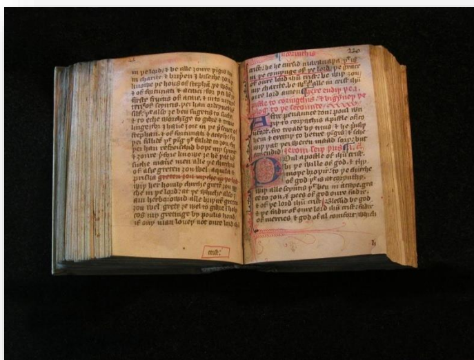
A manuscript copy of Wyclif's Bible