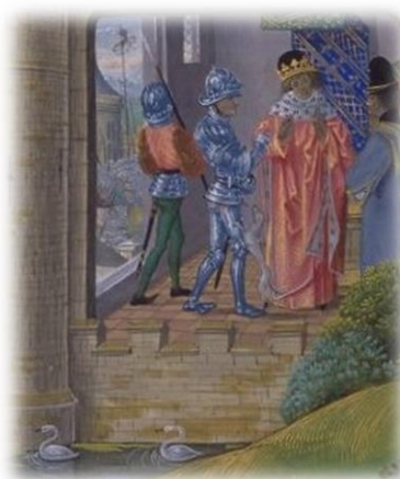
The deposition of a monarch. Richard II is taken into custody by the Earl of Northumberland. From Jean Froissart's Chronicles (15th century manuscript)

As a result of the crisis of authority described in text number [8], King Richard II sought to reassert his authority before the common people, and also before his aristocracy. One of the strategies which he employed was to embark on a campaign of artistic output that sought to sacralize the authority of the king: hence the Coronation Portrait and the Wilton Dypic (shown below). These outward