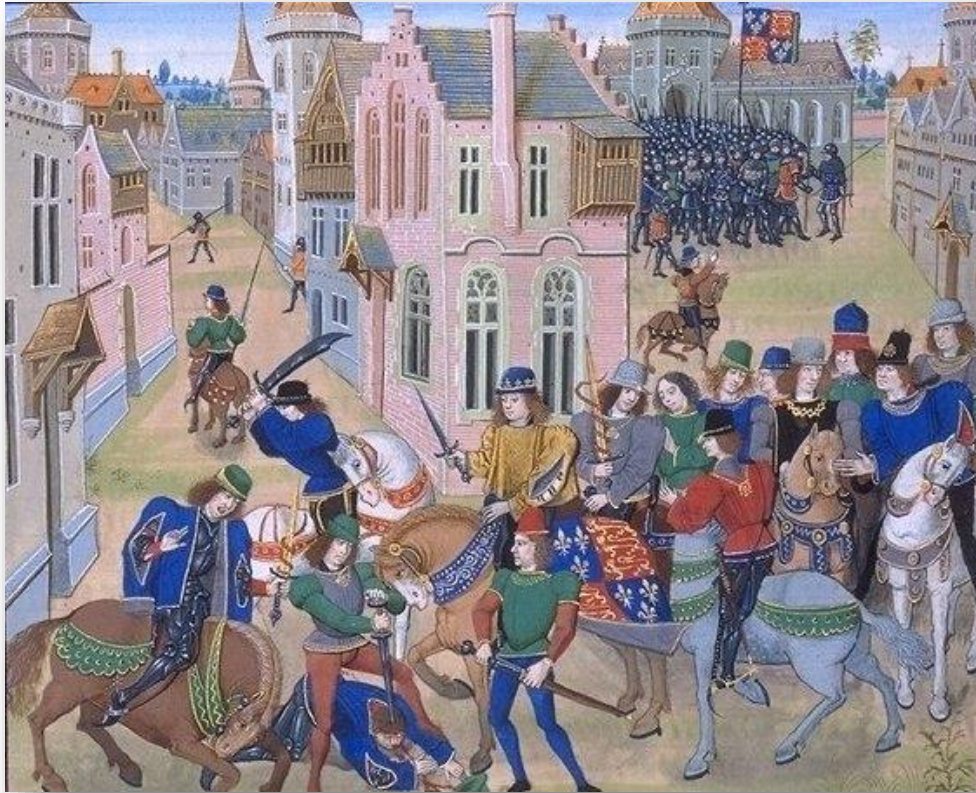
The death of Wat Tyler, the leader of the Peasants' Revolt.