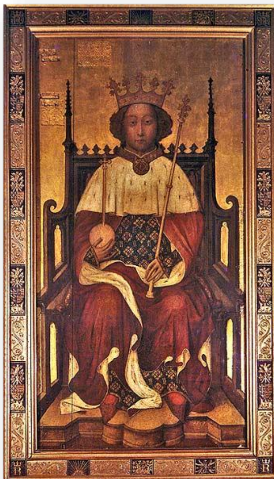
Richard II. Coronation Portrait.