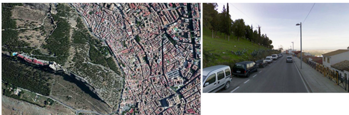
Fig. 1 Area of intervention. Image of "Paseo de Circunvalación" road.

This project investigates specific problems of the historic capillary network: the spacial and urban dimensions of infrastructure elements, like a highway bypass that severs urban relationships in a specific zone, the lack of symbolic conscience and a need for connection between a park and important elements of patrimony. But beyond these concrete circumstances, the possibility of constructing public or urban space as a multirelational system, the creation of internal territorial crossroads and the creation of multivalent functions that permit the friendly coexistence of urban, infrastructural and natural media is an argument for a methodological and disciplinary discussion that permits us to extrapolate solutions and study the conception of universal urban elements.