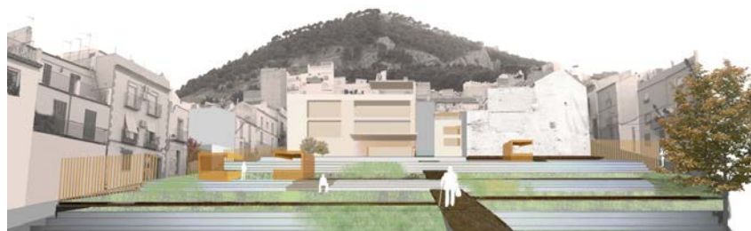
Fig. 4 Table of Social Network Actions.