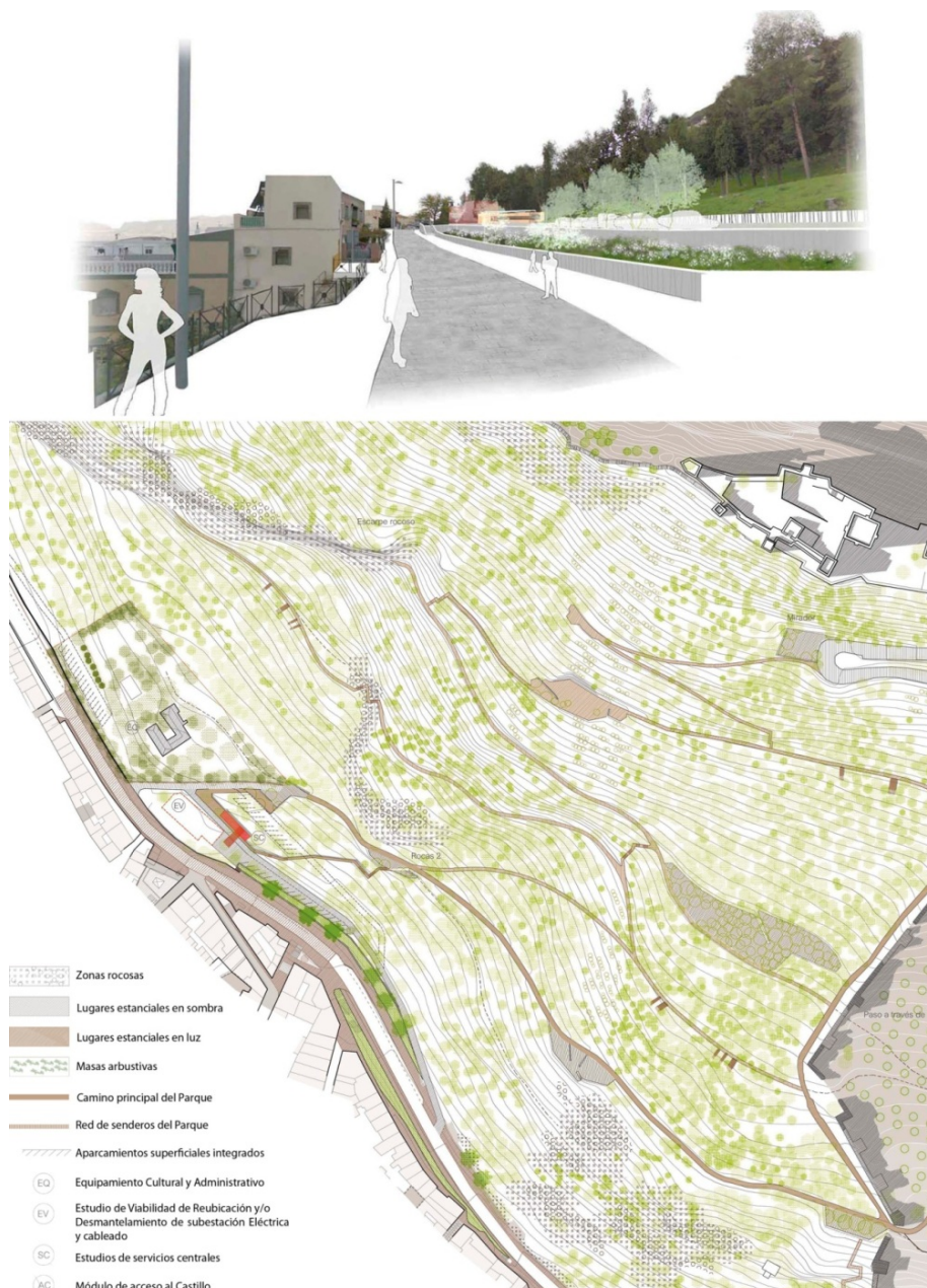
Fig. 3 Detailed cartography of the project area. Access to the park.

The future network of collective spaces, the association between historic neighborhoods and the Castle Hillside Park, the establishment of an intermittent Environmental Hall that connects both urban systems and strengthens the social relationships, the creation of a new fiscal distribution in the planning field for these depressed central areas, or the converting of the roadway infrastructure into a collective and symbolic space with greater spacial comfort and increased intermodality...these are some of the actions of the project that stand out.