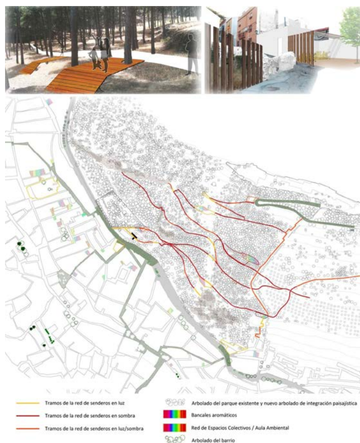
Fig. 6 Environmental network.

With respect to the park, the creation of pausing spaces, grading the surface, increasing the internal circulation through a network of paths that connect certain natural features of the hillside, the increase in the diversity of plants, spaces of light and shade, open and closed spaces, are consequences of the need to convert the hillside into a healthy, environmentally active and socially used space.