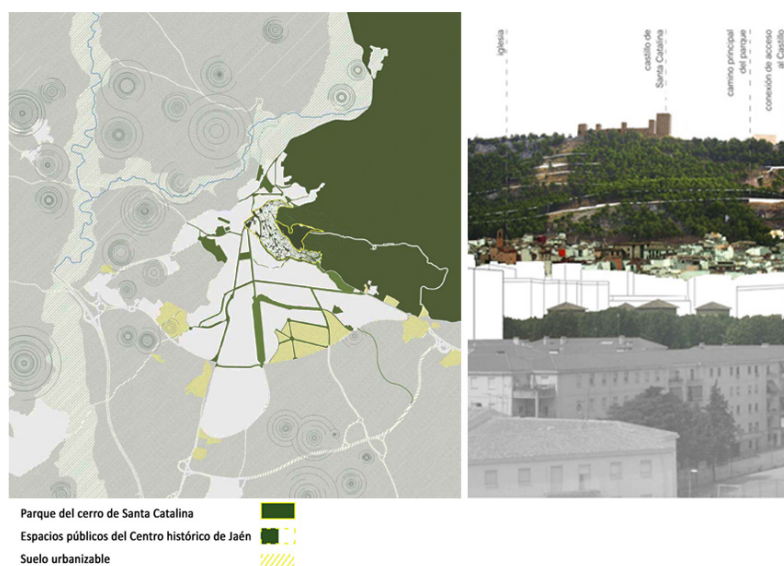
Fig. 2 Territorial dimension of park Cerro de Santa Catalina. Composition of historical layers.