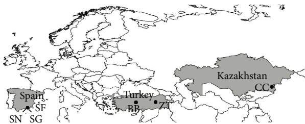
FIGURE 1: Distribution of the studied species: Spain (with three Rossomyrmex minuchae populations: SN = Sierra Nevada, SG = Sierra de Gador, and SF = Sierra de Filabres), Turkey (with two R. anatolicus populations: BB = Belebaci Beli, ZT = Ziyaret Tepesi), and Kazakhstan (one R. quadratinodum population: CC = Charyn Canyon) (from [20]).

parasite-host pairs live mostly in extended plains whereas the Spanish pair R. minuchae Tinaut 1981— P. longiseta Collingwood 1978 inhabits the top of three high mountains in southern Spain (Figure 1). Despite this apparent difference in habitat (extended plains versus high mountains), the abiotic conditions are quite similar and are consistent with a typical arid steppe [7, 18, 19]. However, the main difference comes from the fact that the Spanish populations are small and are geographically isolated from each other [20].