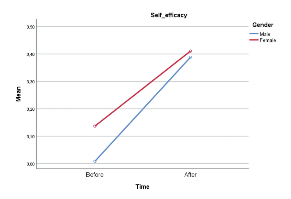
Figure 1. Outdoor training activity by gender and time