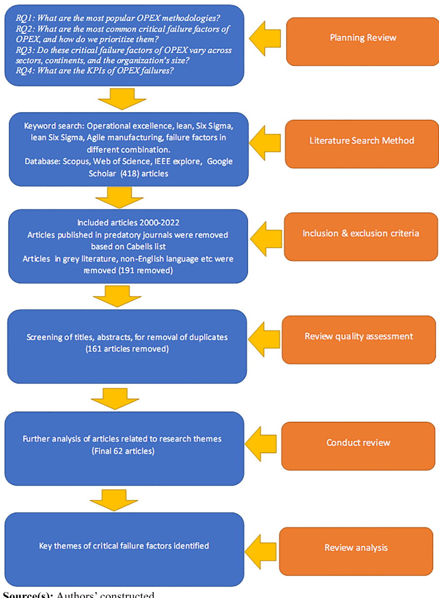
Figure 1. Systematic literature review methodology

As part of this study, a systematic literature review (SLR) was conducted to determine the factors contributing to organizations failing to sustain OPEX initiatives. The SLR process and stages followed are illustrated in Figure 1. The SLR consisted of six phases, starting with planning the review. In this phase, the study's objectives were aligned with the formulation of