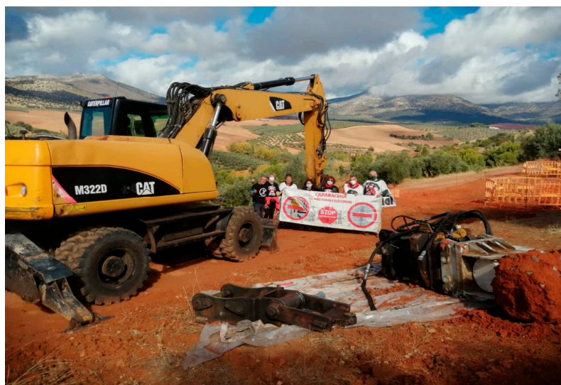
Figure 4. Photography of the gathering of the platform “Say No to Towers” (Di No a las Torres) in Altiplano de Granada in 2020.

Subsequently, in July 2020, the Platform “Say No to Towers in Altiplanos and Geopark” (Di No a las Torres en los Altiplanos del Geoparque) was created in response to the construction of the 400 kV high-voltage line between Baza and Caparacena, the 400 kV substation in Baza and the wind and photovoltaic megaprojects that threaten these territories. Here again, the interviews and workshops show the resistance process that also includes assemblies and mobilisations in the sacrificed territories and joint demonstrations with the platform “Say No to Towers” (Di No A Las Torres) in the Lecrín Valley and Alpujarras as it can be seen in Figure 4, and also demonstrations organised with other organisations such as Environmentalist in Action (Ecologistas en Acción) in 2021.