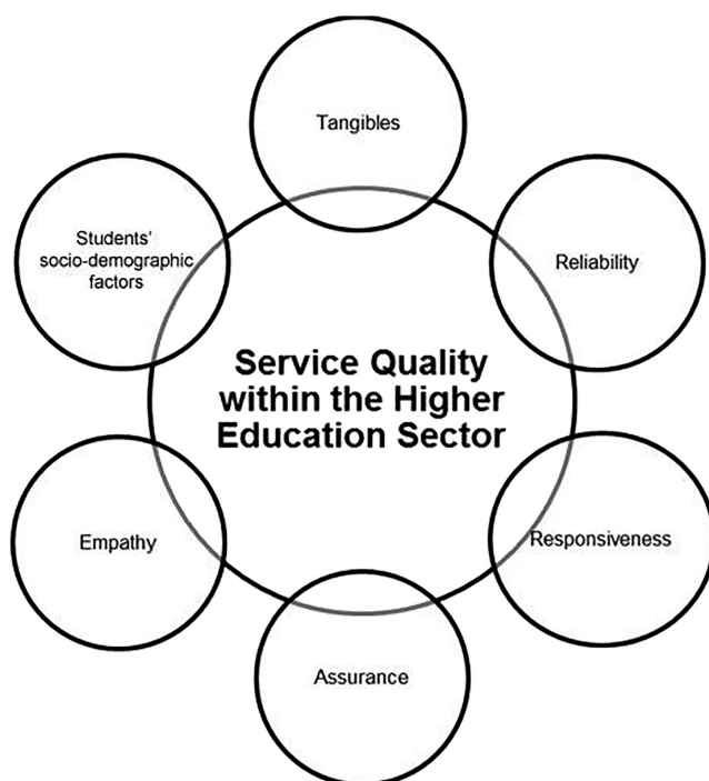
Figure 2. Proposed model

consistency, all correlation coefficients between each item's score and the total of the scale achieved significant values. In this sense, all values are higher than 0.8 so they can be considered optimal [49].