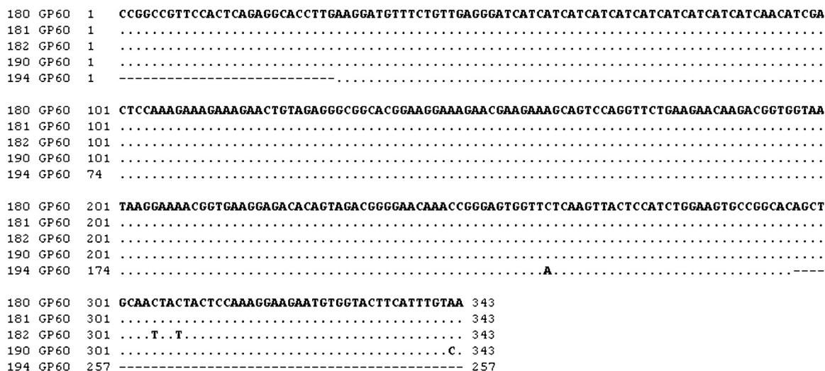
Fig. 2. Alignment of common fragment sequences obtained for the gp60 gene of Cryptosporidium hominis . SNP are marked.

However, the presence of G. duodenalis in the sample from three of the children concerned is interesting. In addition, G. duodenalis isolates belong to different G. duodenalis assemblages, two of them to G. duodenalis assemblage A and one to G. duodenalis assemblage B. The homology between the sequences of G. duodenalis assemblage A was 99.7%, although the fragment studied did not exhibit enough polymorphism to differentiate within the G. duodenalis