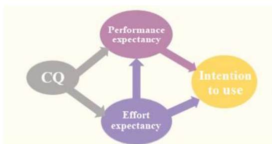
Note: Indirect influence of CQ on the intention to use through its antecedents (performance expectancy and effort expectancy)

All the scales were measured by means of a seven-point Likert scale (1: totally disagree – 7: totally agree). A filter question related to the use of the internet was introduced at the outset of