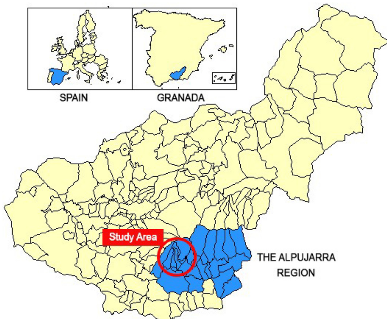
Fig. 1. Location of the study area in the Alpujarra region, Granada, Spain (Adapted from [4]).

to track vehicles entering and exiting the area, and the movements inside the area in each visit, providing a detailed view of their mobility. We have three cameras at the border of the area and we calculate the route of each visit as the cameras that detect the vehicle between the entry and exit cameras. If a vehicle exits through any exit camera and more than 30 minutes pass, the next entry into the zone will be considered a new visit in our dataset. Our dataset is unique as it contains anonymized plate numbers, from which we derived other variables such as time spent in the area or frequency of visits, which is not a common feature in the datasets.