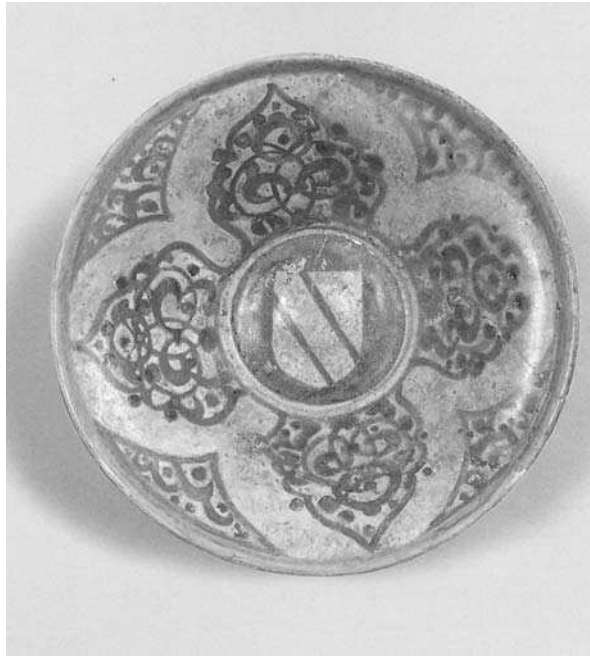
Figure 2. Small safa bowl decorated with the Nasrid coats-of-arms (Alhambra Museum, Granada, Spain).

meaning, some pieces decorated with the sign al-mulk (power) were recovered in Madina al-Zahra. As regards the period of the Hudies from Murcia, during the relative period in which they controlled the area, sgraffiato ware with black decorations was produced extensively (black was the colour of the Abbasid, with whom Ibn Hud was on good terms). On such goods, scenes depicting court life in an oriental style are quite common. 34