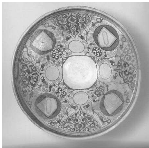
Figure 1. Large safa bowl decorated with the Nasrid coats-of-arms (Alhambra Museum, Granada, Spain).

The role of ceramics as propaganda was not new in al-Andalus. Earlier on, during the caliph period, glazed pottery decorated in green and brown ( verde y manganeso ) served a similar purpose. The role played by sgraffiato ware made in Murcia and its environs during the Almohade period has been interpreted in a similar way. Concerning verde y manganeso production, it has been pointed out that this kind of pottery was made in workshops located in Cordoba, and that the colours used for the decorative patterns were a clear reference to the leading family (white for the Omayyad) and their religious commitment (green symbolized the Prophet). 33 Among the sherds with a strong symbolic