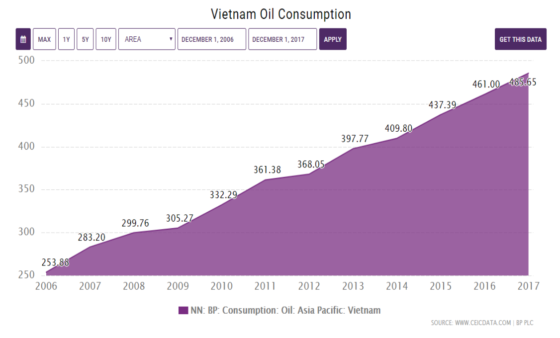
Figure 2: Vietnam oil consumption

By 2017, oil consumption is estimated at 485,000 barrels per day, up 91% compared to 2006.