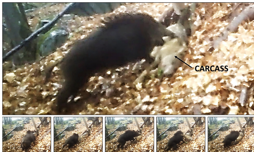
FIGURE 1 Frames of a video recorded by a camera trap at a gray wolf carcass in Susa Valley, western Alps (Italy). Images show fight-and-flight responses of a wild boar, 3 days after carcass deployment (April 23, 2022, at 6:13 p.m.). Frames are chronologically arranged from left to right and the upper image shows an in-between moment in which the wild boar bites the wolf carcass.

In total, wild boars appeared in 26 and 14 events at 8 wolf and 6 fox carcasses, respectively. We recorded six fear-related events at wolf carcass sites (23% of total events at wolf carcass sites) and none at fox carcass sites. These fear-related events included two fight and six flight responses performed by at least five different adult wild boars towards three different wolf carcasses (i.e., 30% of monitored wolf carcasses). Most of these fear responses were recorded during the first stages of the decomposition process (seven responses recorded 2–3 days after carcass deployment and one registered 14 days after carcass deployment) in three different videos. Piglets were recorded at both wolf and fox carcasses.