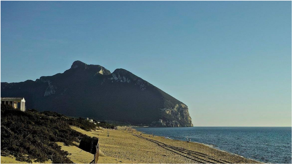
Figure 1: Sabaudia. The Circeo promontory seen from the beach , 2018.

A “scandal” in the eyes of conservatives or, on the contrary, a striking “victory” of the Italian Rationalist Movement in the opinion of the innovators: whatever the assessment may have been, Sabaudia has always been unanimously recognized as a city capable of realizing an extraordinary relationship with the landscape (fig. 1), which made her “hostage to her own fame” 1 .