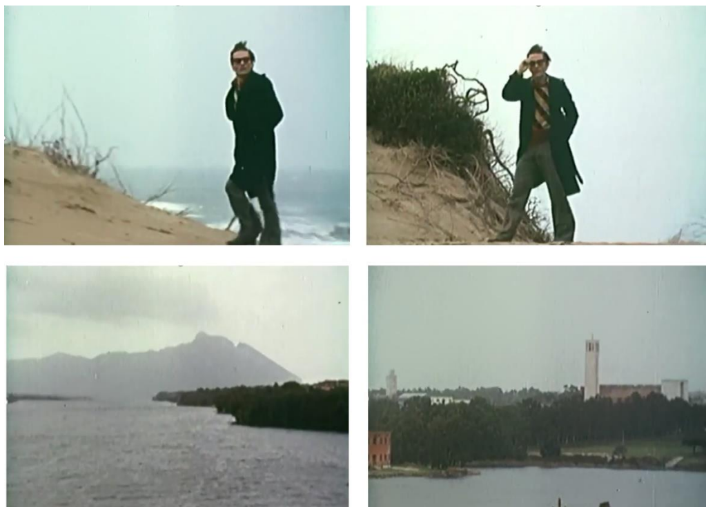
Figure 7: Pier Paolo Pasolini, La forma della città , 1974 (Frames from the movie).