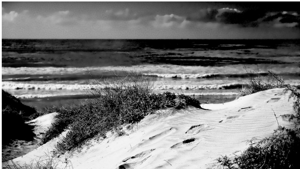
Figure 6: Sabaudia. The dunes , 2018.