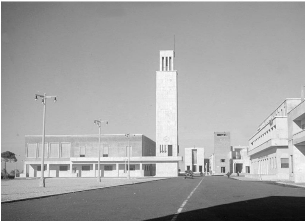
Figure 5: Gino Cancellotti, Eugenio Montuori, Luigi Piccinato and Alfredo Scalpelli, Sabaudia. View of the Town square , 1930s (Consortium for the Reclamation of the Agro Pontino).

The Director of Architettura thus highlights not only the creation of a unitary environment, in which dominant landscape and architectural elements are enhanced through the study of precise views, but also the idea of an organism where part and everything are inseparable.