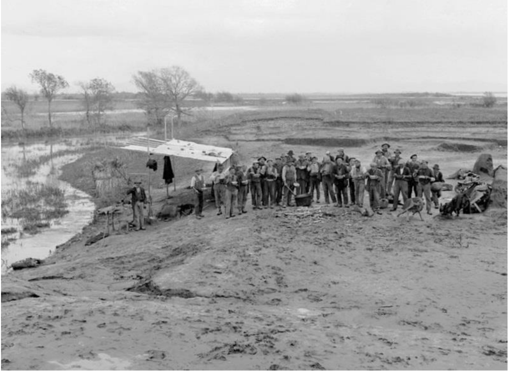
Figure 2: Reclamation of the Agro Pontino , about 1928 (Consortium for the Reclamation of the Agro Pontino).

The operation becomes a sort of amplification chamber of that 'ruralism from the trench' heralded by Mussolini, starting from the Discorso dell'Ascensione in 1927. In fact, if initially the Opera does not formulate specific hypotheses for the assignment of the lands, on which thousands of people lived in precarious conditions for centuries, later the Duce orders that they be attributed to the fascists of the regions most tried by unemployment, like Emilia-Romagna and Veneto, also to fulfil the promise made during the Great War, summarized in the cry "land to veterans".