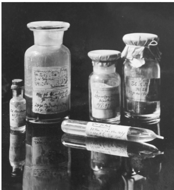
Figure 4. Different serum samples with liquid serum and serum powder, produced between 1897 and 1910. The photograph was probably taken around 1940.

the red blood cells had separated from the serum, the blood was filtered, centrifuged and underwent a bacteriological analysis. If the serum was found to be germ-free, it was treated with 0.5 percent carbolic acid for conservation and to keep it sterile. Every production step was recorded in different registers. After the evaluation procedure had fixed the final value of the serum in terms of immunisation units it was poured into phials that were corked 28 . A label was placed on each phial stating the quantity of serum, its potency in terms of immunisation units, a unique operation number and the date the phial was filled. Finally, the phial was wrapped in paper, packed in a wooden box, and sent out to the pharmacies 29 . Arnold Eiermann remarked at the end of his article that the horses were in excel-