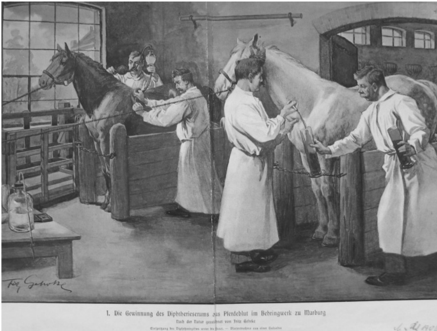
Figure 3. A popular picture of the production of diphtheria serum at the Behringwerke in Marburg, around 1906. On the left side the inoculation of toxin, on the right side the bleeding.

building. When the value of the antitoxin had reached the highest possible point, the horse was brought into the operating room, tied up, the puncture point shaved and disinfected, and a trocar was placed in the jugular vein. The blood came out via a cannula and was collected in a sterilised vessel. The process was used to collect five or six litres of blood per horse providing three litres of serum 27 .