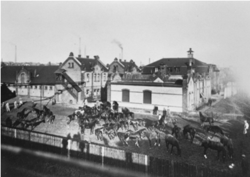
Figure 1. The Bacteriological Department at the Farbwerke Hoechst after 1900. Emil von Behring Archive, Marburg – Germany.

with carbolic acid for conservation 26 . The production of toxin was difficult because the process depended on the strain of bacteria, the culture medium (agar or nutrient solution), the preparation of the culture medium, the duration and the temperature of the breeding process, and the disinfectant used to kill the bacteria. The precise manner of producing the toxin varied from company to company. The process was important for the fabrication of serum because the value of the serum depended on the strength of the toxin used to immunize the animals. On the one hand, the more potent the toxin, the more powerful the final serum, while on the other hand, a strong toxin could cause inflammations at the injection site, and hinder the process of serum production.