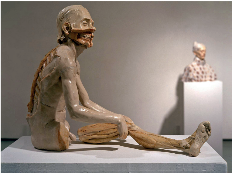
Figure 3. Eleanor Crook: «Snuffy» Polyester resin, ½ life-size, 2000. Collection of the artist; used by permission.

(figure 3). Despite his putative humanity, Snuffy seems to display virtually no affect, no external quiver or nuance of pose and expression that might suggest an interior life. His most obvious raison d'être seems to be simply the abject display of his more-or-less anatomized jaw, back, and right leg. The left leg has peremptorily been removed and discarded —a macabre literalization of the phrase disjecta membra . Whether or not he retains some «interior sense» of that physical abjection is a moot point.