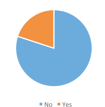
Students who have been to the US

First of all, when students were asked if they had ever been to the US, only 5 of them answered positively, while 20 had not been to the country (Figure 2).