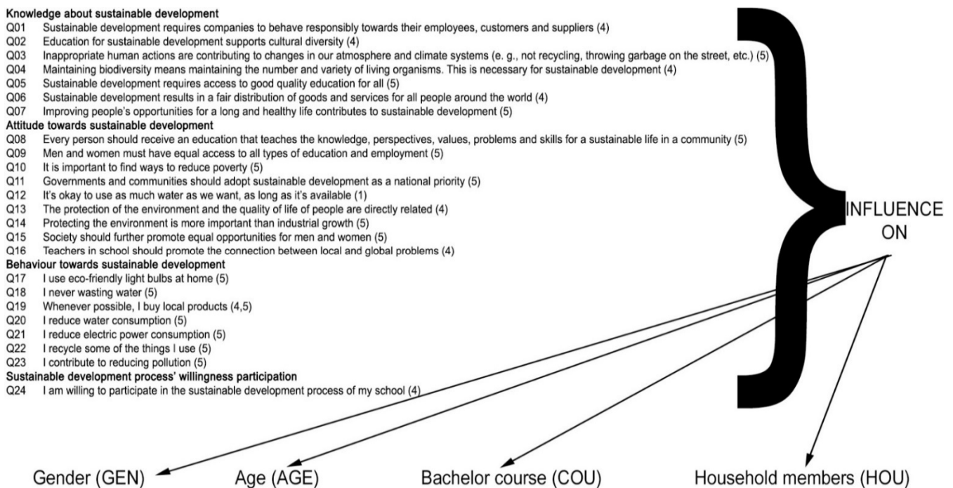
Figure 1. Model of proposed structure.