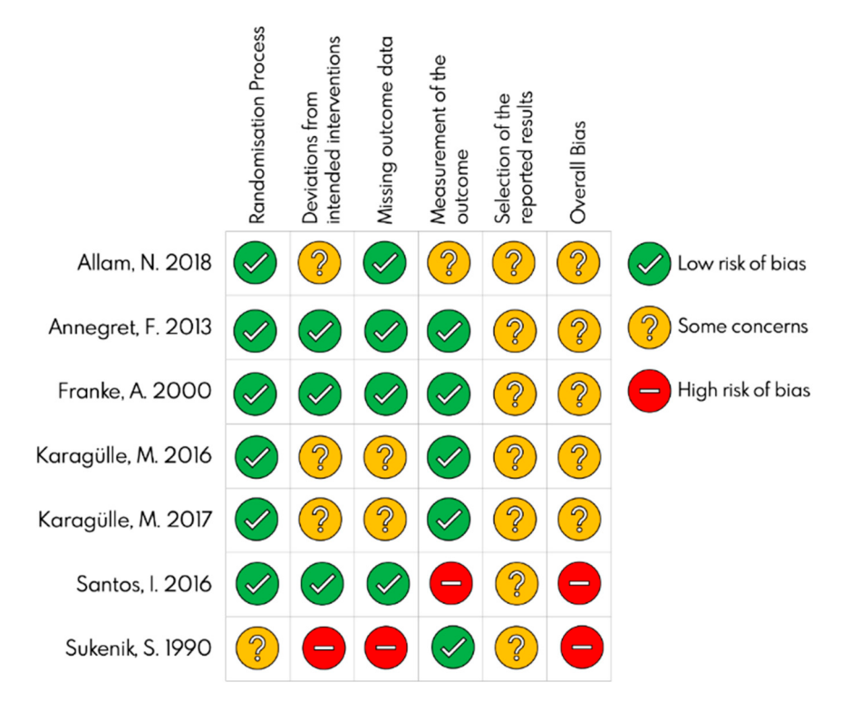
Figure 2. Individual risk of bias [24–30].

The risk of bias of the included studies was measured using the Cochrane Tool. Figure 2 shows the risk of bias of each study, and Figure 3 shows see the global risk of bias. A high risk of bias for found for the studies by Santos I et al. [29] and Sukenink S et al. [30]. The most repeated bias was the selection of the results because none of the studies included a protocol for the statistical analysis. The next most repeated bias was deviation from the intended intervention.