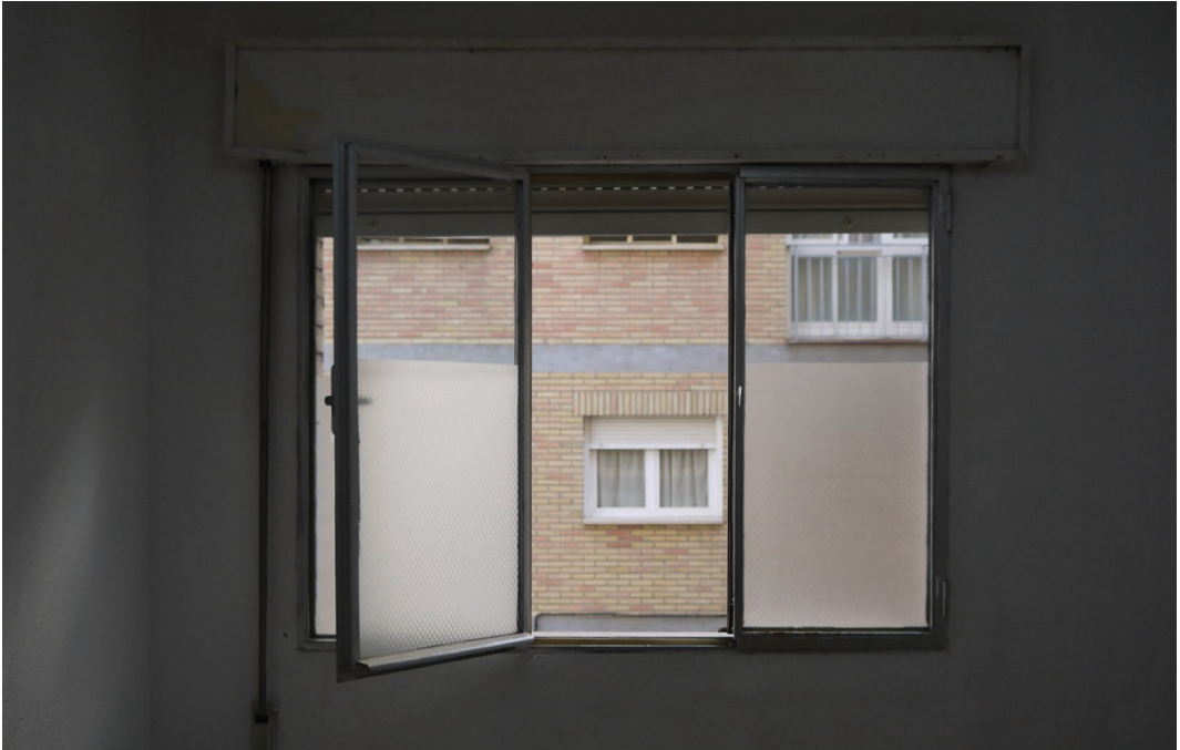
Fig. 2 – View from the window of a typical residential building from the 60s in Granada (Spain). The awkward perspective and the threat to privacy have led to veiling the lower half of the glass.

learning, and enjoying free time that are here to stay, being the expansion of virtual activities perhaps the most apparent. These novelties imply a more intensive use of the home, which is no longer understood as a simple night shelter but becomes a classroom, office, study room, or gym at different times. To adequately host these functions, a comforting link to the outside world has proved to be desirable, in addition to the obvious spatial flexibility. Besides, now that many of us have experienced the impossibility to leave home, it seems opportune to remember those collectives with permanent or transitory limited mobility due to illness, age, or childcare, whose psychological needs also have to be met. Architects should integrate the experience of the environment in new housing, office, sanitary or educational projects – to cite just some of the activities which involve longer stays inside of buildings.