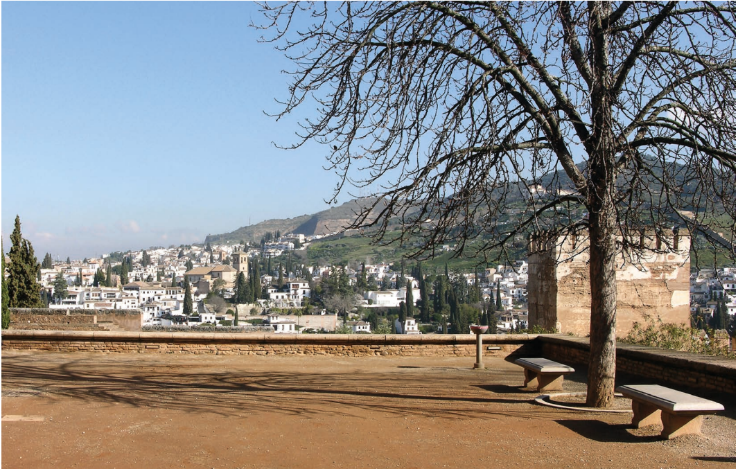
Fig. 4 – A chance to rediscover the landscape of Granada from an empty Alhambra in the absence of tourists.

that only differ from the previous ones in compliance with current construction regulations should be avoided, as these operations evade commitment to the urban landscape. Building ordinances, like other sectorial or specific provisions, should be integrated into such an ‘interior urban landscape’ strategy, as they only rule some of the elements of the urban environment. Moreover, landscape design seems critical to re-qualify ‘interior urban landscapes’ by affirming voids as indispensable parts of the urban ecosystem rather than remaining plots waiting to be occupied. Urban voids must come to be understood as ‘full’ of other contents just as essential as those hosted by buildings for the proper functioning of the city. By integrating natural processes, humans and non-humans, adaptability, indeterminacy, and change, open spaces should become a structural part of the town and a reservoir for the future: a true ‘green infrastructure’ (Batlle, 2013).