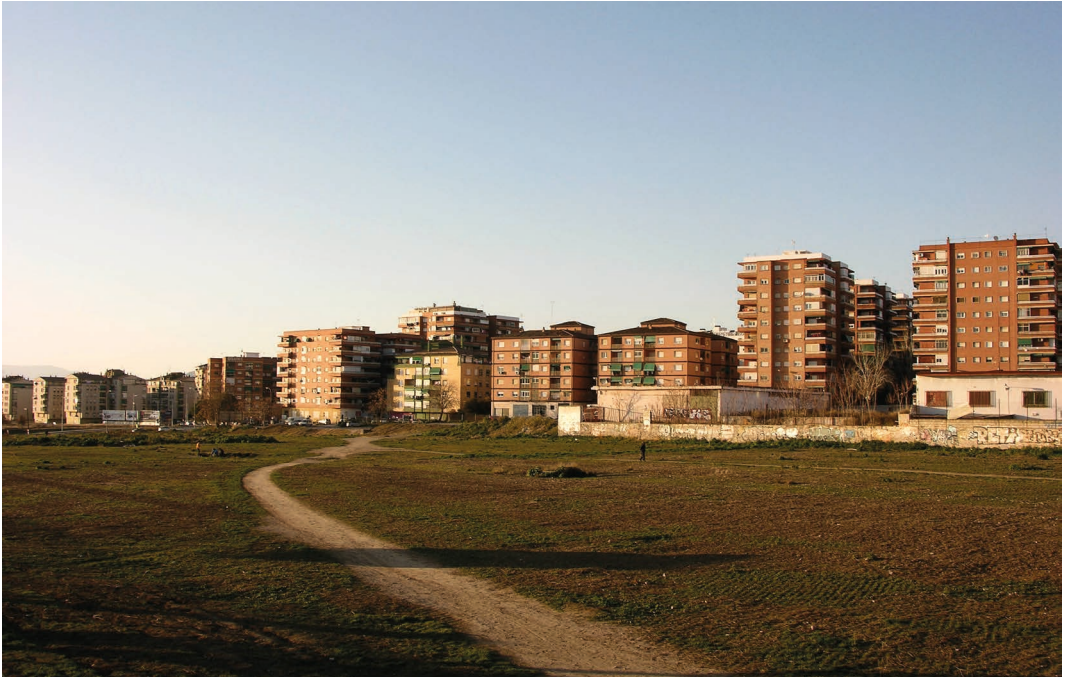
Fig. 3 – Exterior image of a working-class district in Granada (Spain) seen from an open terrain vague next to the railway. Inhabitants spontaneously use the expectant land for recreation, pet walks, sports, and gatherings due to the high density and low urban quality of the built area.

ly orientated, and overlooking low-quality urban spaces. Thus, many of these windows are veiled, and numerous balconies appear illegally closed or converted into linear storages on the façades. Also, flat roofs of collective housing buildings seem almost invariably forgotten and relegated to occasional maintenance of technical installations. These elements have frequently been neglected by standardized architectural design due to their low monetary profitability. An ambitious urban housing refurbishment strategy could involve upgrading these terraces, access galleries, porticoes, or rooftops, converting them into winter gardens, urban orchards, private or communal open spaces. In this sense, landscape architecture can significantly contribute to making coherent, adaptive, and stimulating those transitions between inside and outside in existing and projected residential areas. A fruitful collaboration between architects and landscape ar-