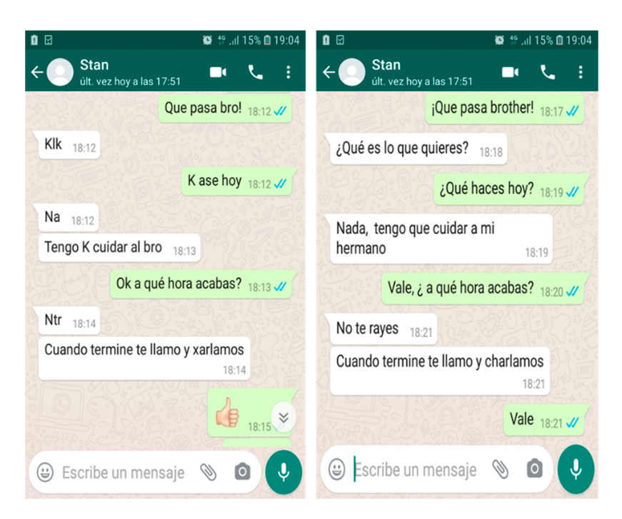
Figure 2. ( Left ) Snapshot of WhatsApp provided by an informant in which the suppression of phonemes and incorporation of loanwords is observed. ( Right ) Recreation of the transcribed conversation in accordance with the rules of the analog environment.

It serves to indicate that, for a meaningful group of informants (38.5%; n = 30), the exchange of information in other languages is a reality which forms part of the virtual context in which young people operate without any difficulty. In this sense, it was confirmed that, within this group of disadvantaged young people, expressions from other languages are shared via networks, games, memes, WhatsApp or tweets. This highlights the linguistic abilities that are traditionally associated with groups of young people in advantaged groups. Nonetheless, as clarified by those interviewed, this type of language tends to be supported by the context in which it takes place, in addition to by images in the form of gifs and emoticons. These help the message being presented to be understood. This line of argument is observed in association with analysis of the linguistic visual category, which outlined the importance given by interviewees to the exchange of images, gifs, emojis and memes as a means of transmitting and expressing feelings, emotions, anger or acceptance. One of the informants explained this in the following way: "An image is worth more than a thousand words".