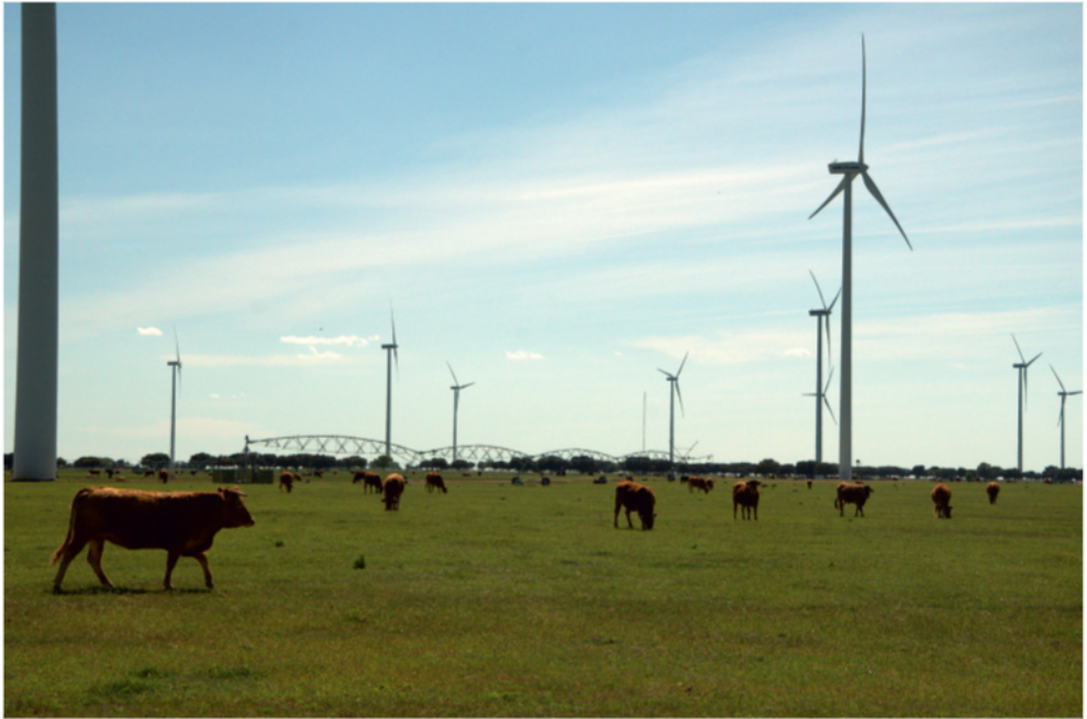
Photo 1. Wind farm “San Lorenzo”, Castilla y Leon, Spain

factors, such as night lights, shadow flicker and the stroboscopic effect (KIL, J. 2011).