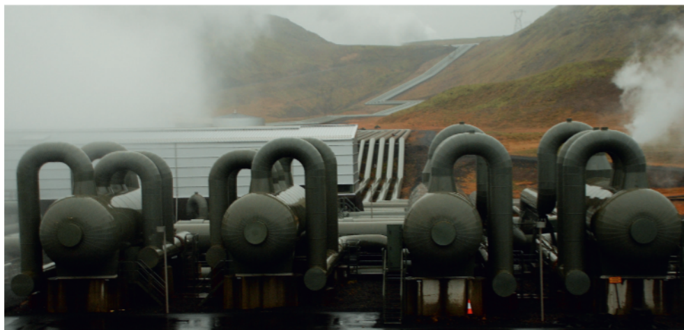
Photo 2. Hellisheiði Geothermal Power Station, Iceland

GE is often presented to the public as almost without any substantial environmental impacts, apart from direct modifications of the physical landscape with construction. However, its landscape impacts related to environmental issues are considerable too (KRISTMANNSDÓTTIR, H. and ÁRMANNSSON, H. 2003). Especially the use of high-enthalpy fields entails a range of negative consequences, some of which can affect landscape quality in a less direct way. Stability of hillsides can be weakened by thermal changes in the soil and landslides have oc-