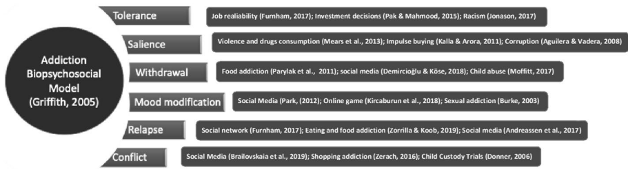
Fig. 2 Contexts where addiction features (Griffiths 2005) and dark traits have been associated

shared with dark traits in relationship with other issues around both positive and negative psychosocial phenomena. How will be the relationships in athletes?.