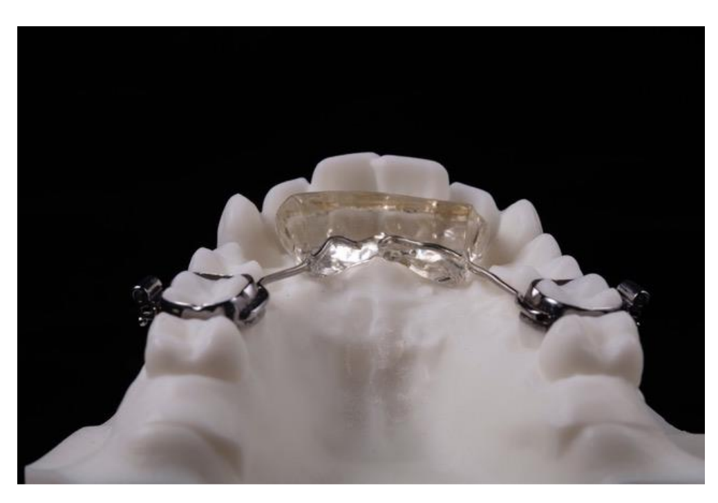
Figure 2. Acrylic resin wedge in the lower incisors.