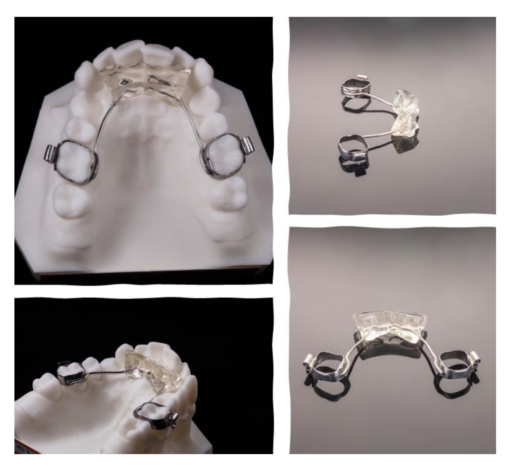
Figure 1. Austro Repositioner appliance design.

Subjects were treated in two phases. The first phase comprised the Austro Repositioner appliance, according to a previously described protocol [10] (Figure 1), specially designed by brachyfacial patients; in brief, the acrylic resin wedge was extended to the upper incisors, and in this anterior segment, the wedge was 1.0–1.5 mm thicker.