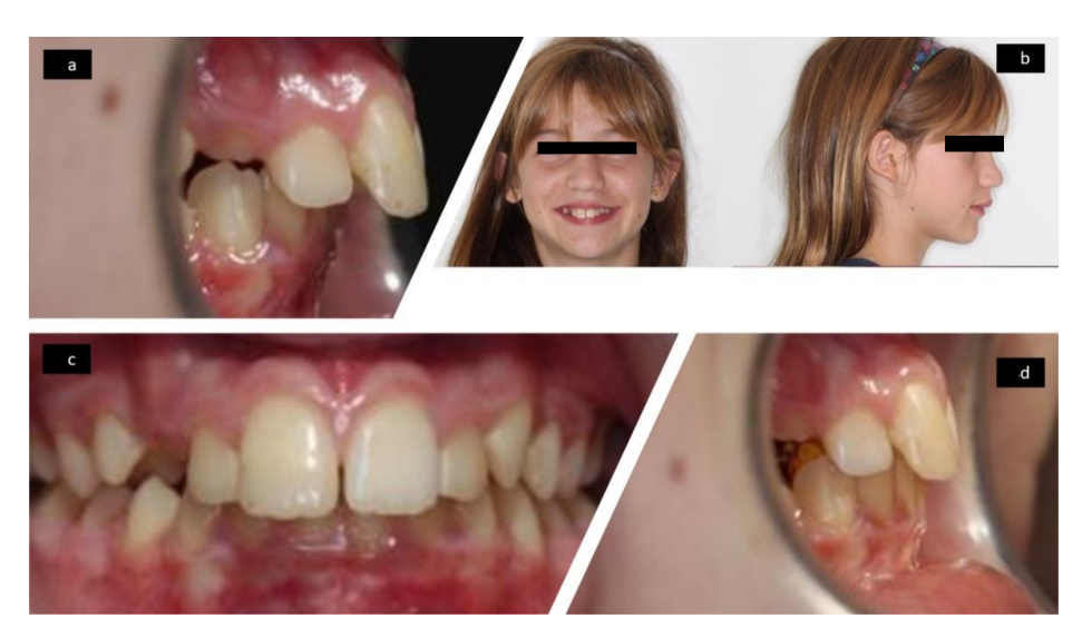
Figure 4. Photographs at T1: lateral intraoral without Austro Repositioner appliance ( a ), frontal and lateral facial ( b ), frontal intraoral ( c ), lateral intraoral with Austro Repositioner appliance ( d ).