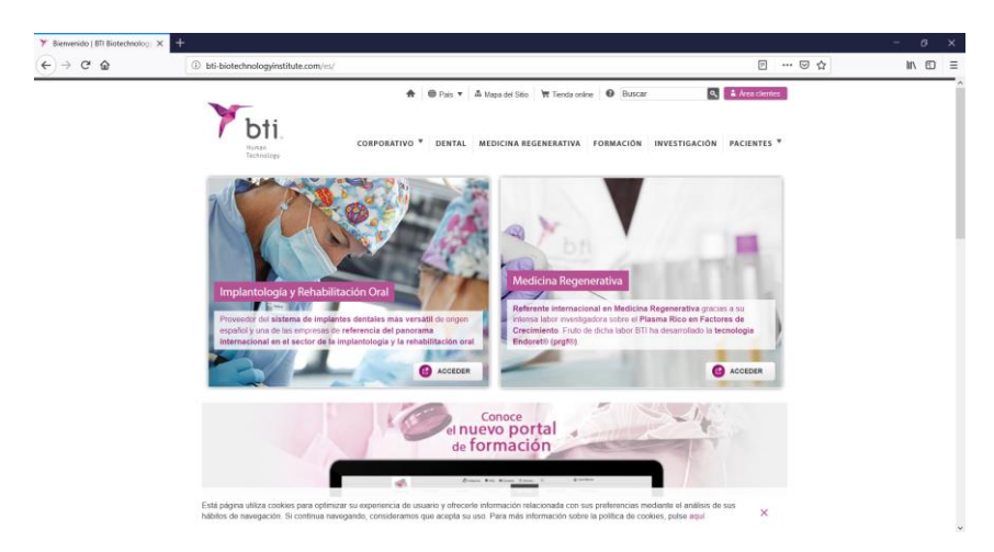
Figure 1: Biotechnology Institute, SL website for Spain: http://bti-biotechnologyinstitute.com/es/

In figures 1, 2 and 3 notable differences can be observed between the designs of the original website, the international English version and the Australian version, also in English.