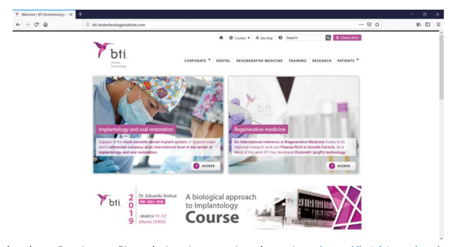
Figure 2: Biotechnology Institute, SL website, international version: http://bti-biotechnologyinstitute.com/