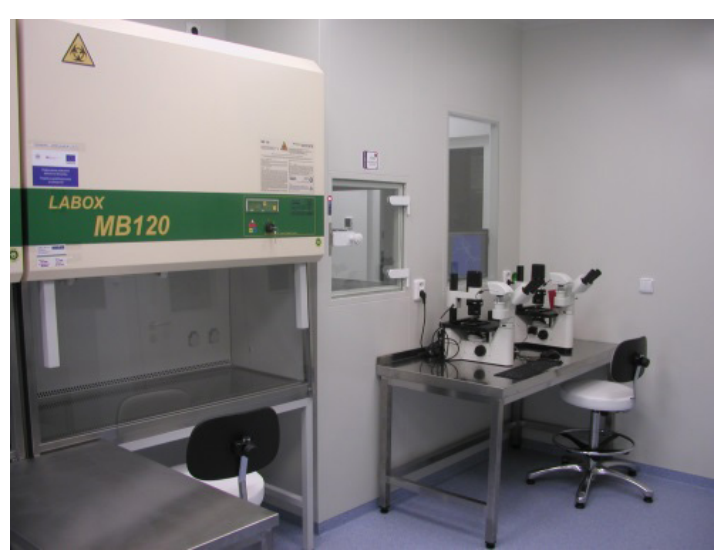
▲ Figure 1 . Cleanroom facilities for cell cultivation according to GLP standards.

pressurization, temperature, humidity and specialized filtration were all tightly controlled. People and materials entered and exited the cleanroom through airlocks (material pass box), gowning rooms and they wore special clothing designed to trap contaminants that are naturally generated by the body and skin. Cells were handled inside biological safety cabinets and cultivated in the gas incubators (figure 1).