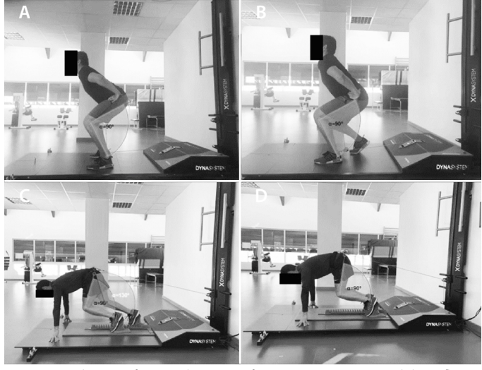
Figure 1. Evaluation of maximal isometric forces. Isometric squat with knee flexion at 90° (A), isometric squat with dominant knee forward and flexed at 90° (B), maximal isometric force of the lower-body exerted on starting blocks with dominant knee forward and flexed at 90° (C), maximal isometric force of the lower-body exerted on starting blocks with both knees at 90° (D).

separation of the feet was the projection of the width of shoulders towards the floor. In this execution, the forefoot supported the whole sole while the delayed foot only supported the metatarsal (straight back and hands laying on hips). (Figure 1B) III) MIF of the lower-body exerted on starting blocks with dominant knee forward and flexed at 90°, delayed knee flexed at 130°. In this test, the lateral separation of the feet was given by the structure of the starting blocks. In this execution both soles rested on the entire surface of the starting blocks, the back was straight and hands never lost contact with the floor ("set" position). (Figure 1C) IV) MIF of the lower-body exerted on starting blocks with both knees at 90°, the lateral separation of the feet was given by the structure of the starting blocks. In this test, both soles were supported on the entire surface of the starting blocks, the back was straight and the hands never lost contact with the floor ("set" position). (Figure 1D)